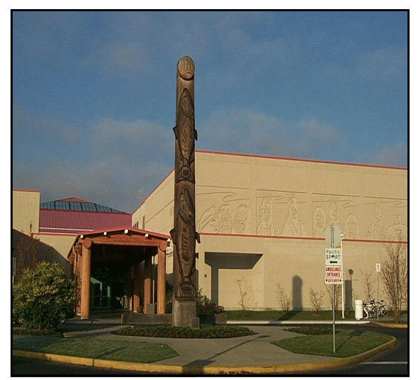
Totem Pole and fresco, Saanich Commonwealth Place Artist: Roy Henry Vickers