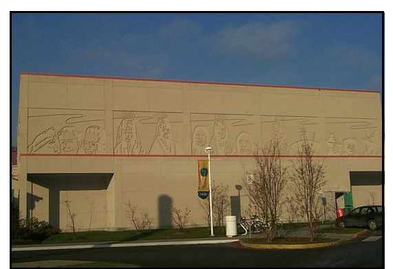
Fresco, Saanich Commonwealth Place Artist: Roy Henry Vickers