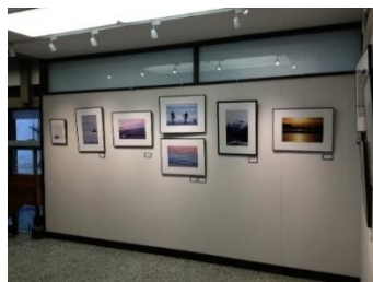
Mezzanine Gallery Wall