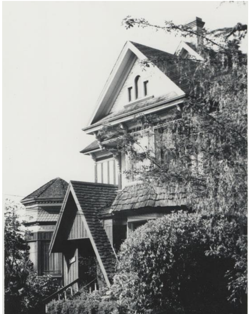
3010 Quadra Street

These volumes contain early landowner names; legal description, size, and values for the properties; and notations. The assessment information is listed in oversized ledgers, but certain years are available in spreadsheet format.