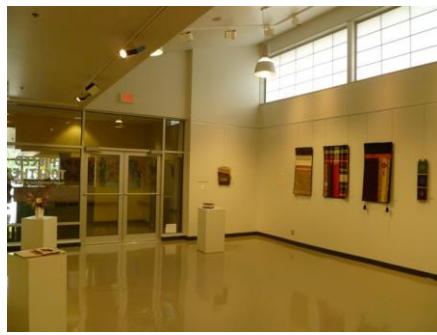
Main Gallery view from rear door to entrance