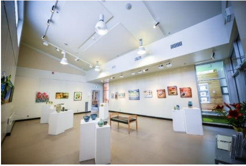
Main Gallery view from entrance to rear