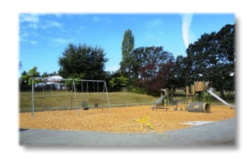
Google map link: https://goo.gl/maps/roAzAzBBBr22