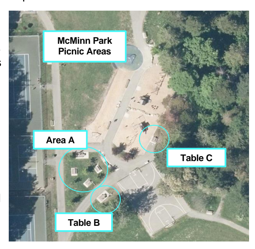
Table C: This is one (1) table and can seat 6 comfortably. Located beside the playground.

Google map link: https://goo.gl/maps/oAcNgj8NTdx