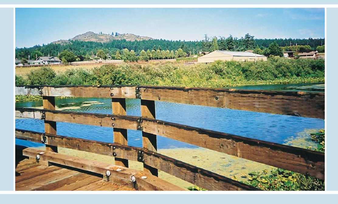
A view to Mt. Douglas. Hike the network of trails or go to the summit for the best panoramic view of Greater Victoria.