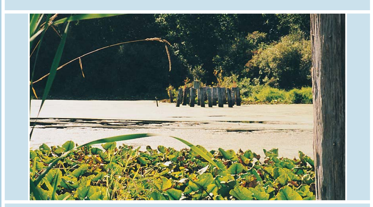
Remnants of the railway trestle built during World War 1.

The driving of the "Last Spike" ceremony, held September 9, 2000 marked the official opening of the bridge.