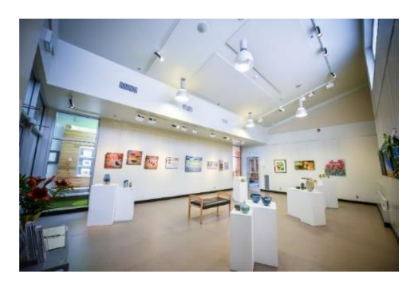
Cedar Hill Main Gallery

The gallery space is approximately 68 square meters (730 square feet) and approximately 31' long x 21' wide. The hanging system is 24.3m (80 feet) and holds 40 adjustable hanging cables and 60 hooks. Gallery lighting features a fixed spot lighting system with west facing skylights.