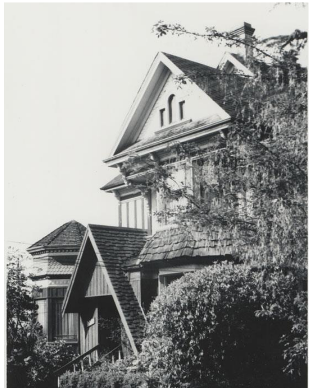
3010 Quadra Street

These volumes contain early landowner names; legal description, size, and values for the properties; and notations. The assessment information is listed in oversized ledgers, but certain years are available in spreadsheet format.