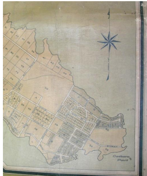
Inset of Cadboro Bay, Wall Map, ca. 1912

This collection includes approximately 3,500 plans, 1906-1980, including residential and commercial structures, sketch plans of proposed additions and outbuildings, subdivisions, and public works proposals. This collection is not exhaustive and does not include all structures in Saanich. The Saanich Planning Department, Inspections Division, also has some building plans. They may be reached by phone at 250-475-1775 Extension 5457.