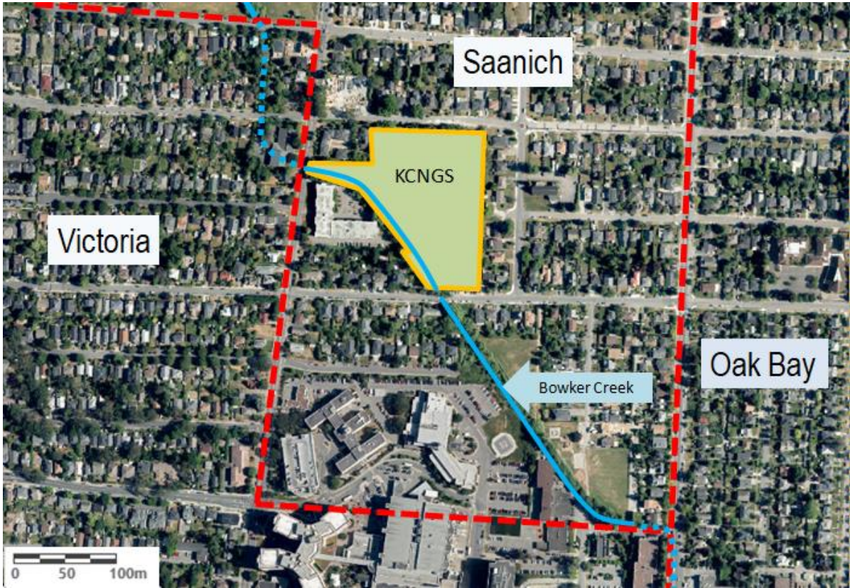
Map 1. Proximity of the KCNGS to Victoria and Oak Bay and Jubilee Hospital