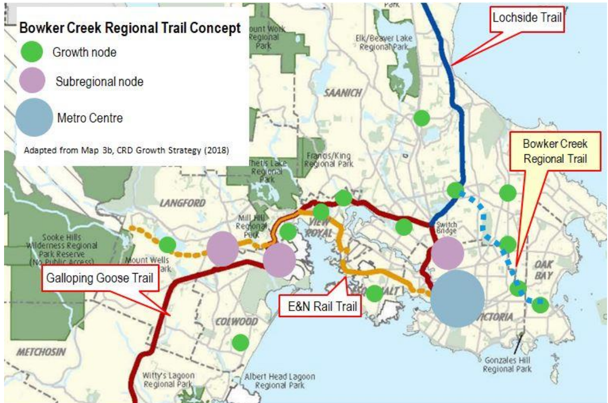
Map 2. Connection through the Bowker Creek Greenway to access Regional Trails