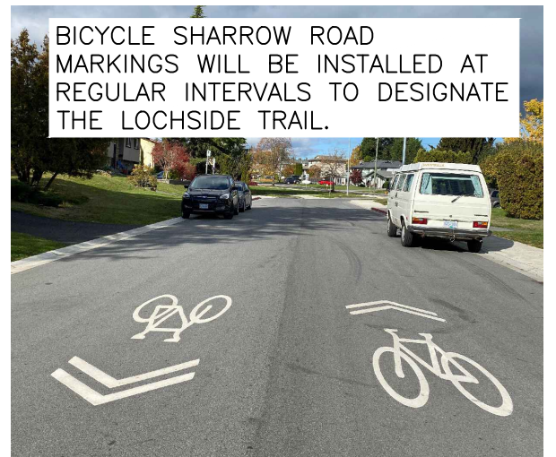
BICYCLE SHARROW ROAD MARKINGS WILL BE INSTALLED AT REGULAR INTERVALS TO DESIGNATE THE LOCHSIDE TRAIL.