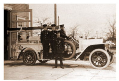
Saanich's first fire truck

Both the Saanich Police Department and the Saanich Fire Department hold and protect their own archives and artifacts.