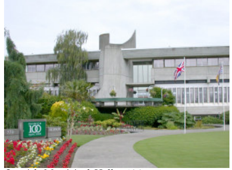
Saanich Municipal Hall - 1965 to present