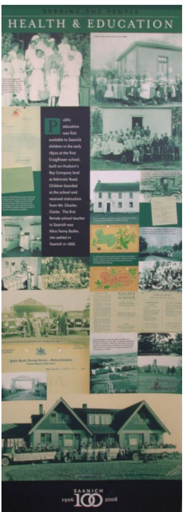
Saanich Heritage Health and Education Display