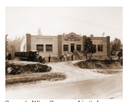
Grower's Wine Company Limited Building and Staff, 1927