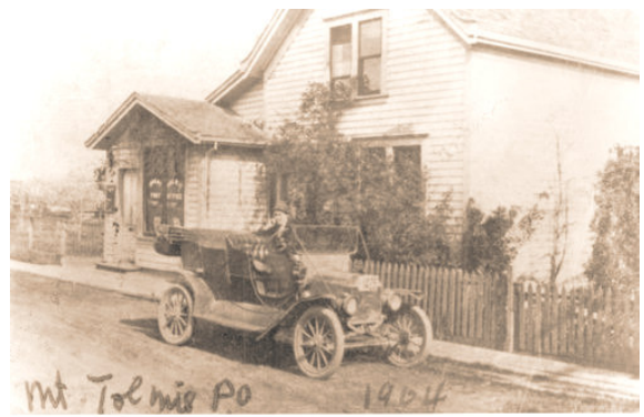
Mt. Tolmie Post Office, Cedar Hill Road, 1904