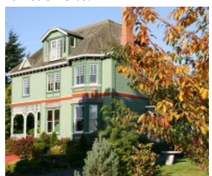
Telegraph Bay Road

In August 2006 a Heritage Sites layer was added to Saanich's GIS Online Mapping System. This resource is available on the Saanich website. This layer shows locations and heritage status of all sites listed in the Saanich Community Heritage Register. There are plans to add photos and building descriptions for each site.