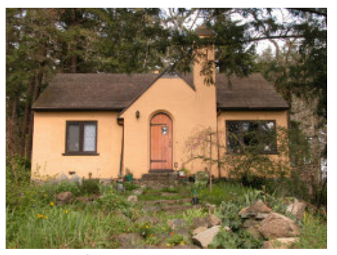
Stranton Lodge Community Heritage Register