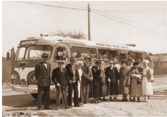
An Outing to the Butchart Gardens Saanich Archives