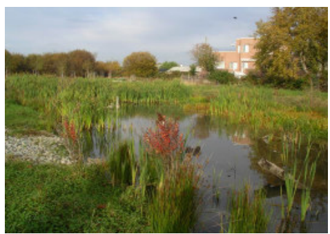
Peer's Creek in the Wilkinson Valley

Conservation of heritage resources also play an important role in creating a sustainable environment which is another focus of Saanich's Strategic Plan. Heritage buildings can be recycled for reuse or adaptive reuse. It is prudent to reuse existing resources rather then filling the landfill, and increasing the demand and energy of producing and shipping new building materials.