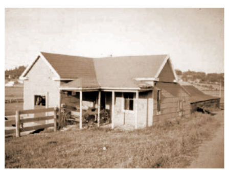
Saanich Municipal Hall 1906

The Saanich Heritage Management Plan, endorsed by Council in 1999, provides the policies and procedures that direct the future management of our heritage resources. The Heritage Action Plan aims to provide specific and attainable action items to implement and fulfill the recommendations and policies of the Management Plan and to support the vision presented in the Saanich Strategic Plan, 2006-2010.