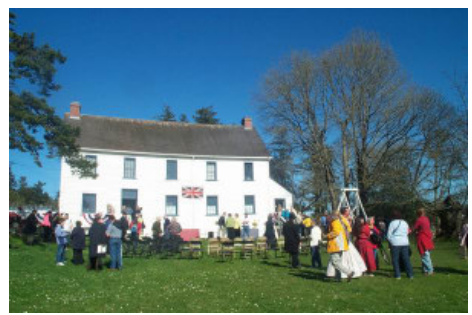
Craigflower Schoolhouse 2005 - Craigflower 150th Anniversary The Land Conservancy

The Foundation also supported the Land Conservancy in the maintenance of Craigflower School in Saanich.