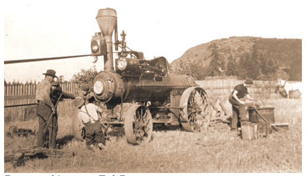
Farm machinery at Tod Farm