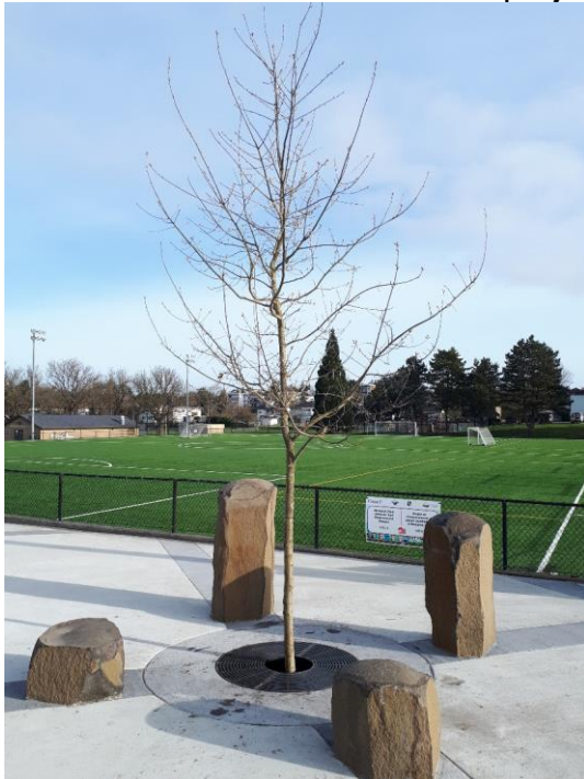
Hampton Park soil cell Crimson Oak. First soil cell in Saanich.