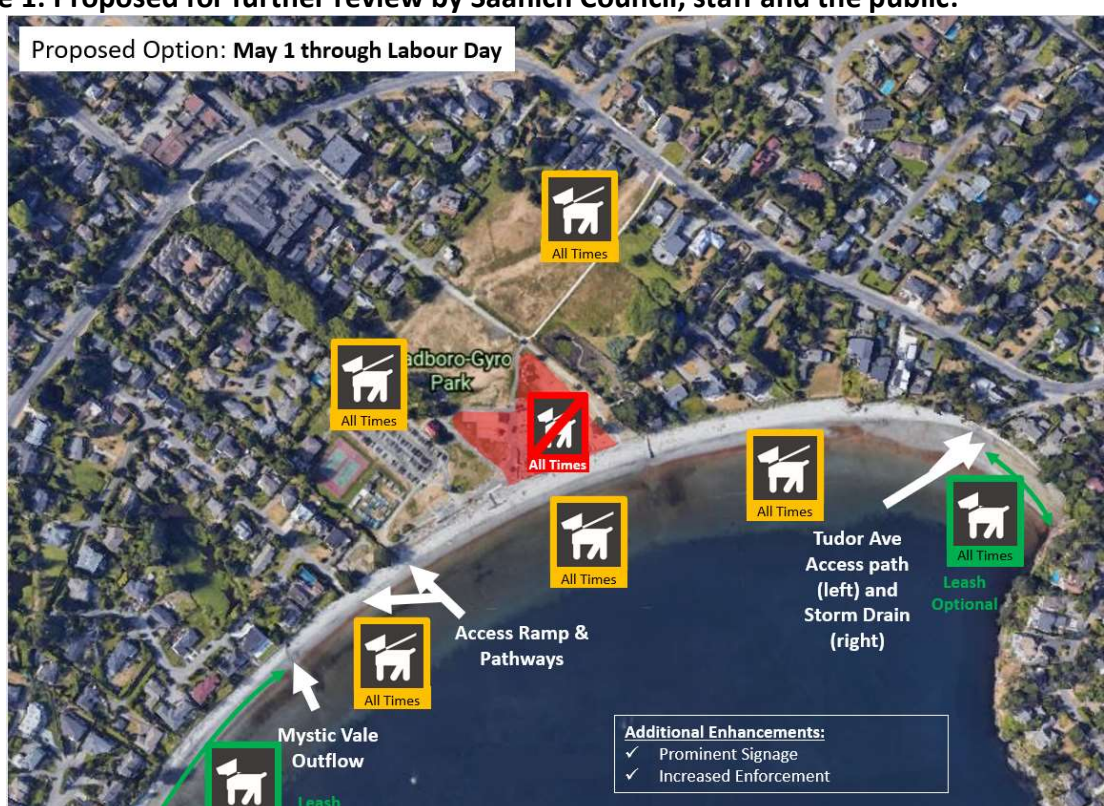
Figure 1: Proposed for further review by Saanich Council, staff and the public: