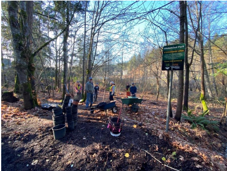
Volunteers planting while maintaining a safe distance

Park user groups: Fall season saw soccer starting up their usual season with COVID-19 protocols in September and ball ended at Thanksgiving. COVID-19 created an immense, but necessary, administrative workload in supporting groups with COVID-19 safety plans and updates to comply with the frequently changing Public Health Officer orders. Overall in 2020, Parks resumed / re-resumed more than 100 user groups and issued permits accordingly for various activities. Parks would like to acknowledge the role that all parties played to bring activity back safely into parks including Parks staff, Public Health Office, sport governing bodies and the user groups (and more). Everyone acted with integrity and professionalism during these sensitive and challenging times with the goal of doing it right for public safety. 2021 is off to a slow start with the current province-wide restrictions, but planning will proceed as normal to resume groups unless PHO orders and restrictions remain in place.