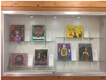
ICA Youth Art Project: This is Me