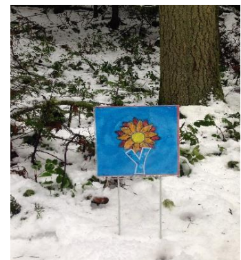
Word Art in Doumac Park