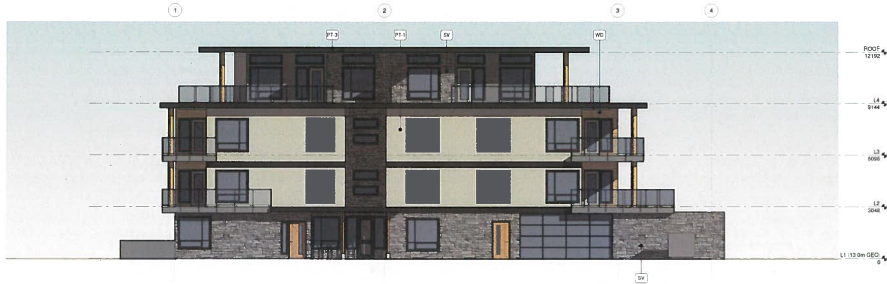
1 EXTERIOR ELEVATION - SOUTH 1:100