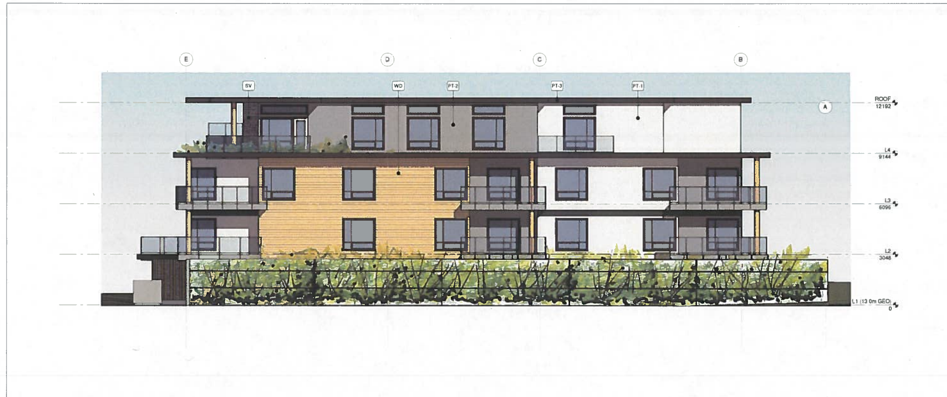
2 EXTERIOR ELEVATION - EAST 1:100