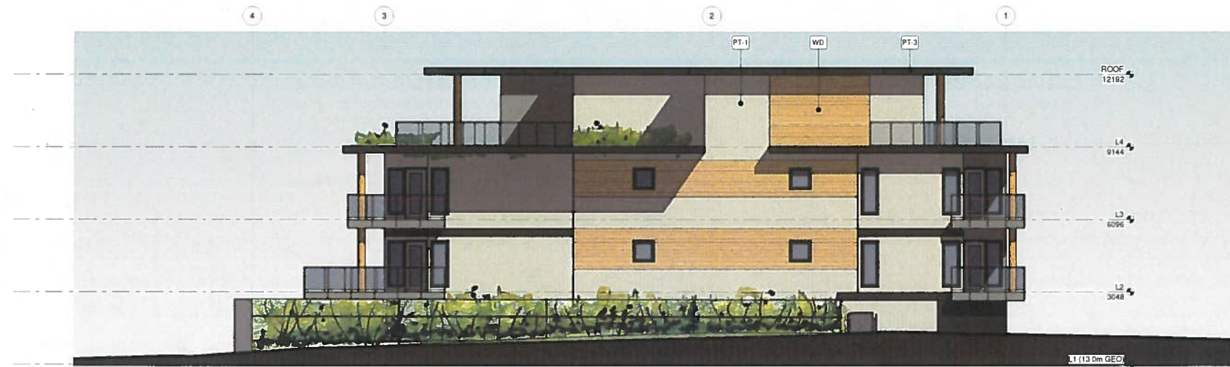
1 EXTERIOR ELEVATION - NORTH 1:100