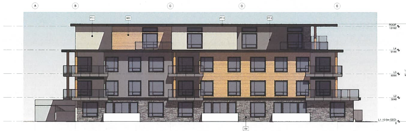
2 EXTERIOR ELEVATION - WEST 1:100