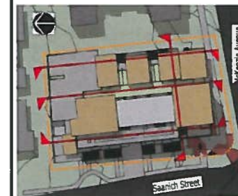
SCHEMATIC SITE PLAN

ERIC BARKER ARCHITECT inc. 727 PANDORA AVENUE VICTORIA B.C. (250) 385-4565 Fax (385-4566) V8W 1N9