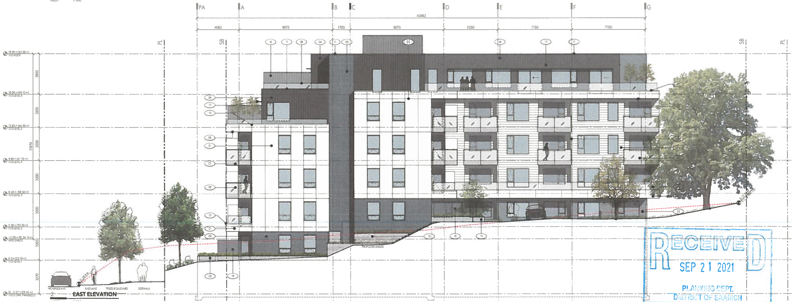
2 EAST ELEVATION