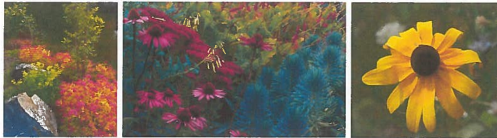
PERENNIALS & SHRUB PLANTINGS