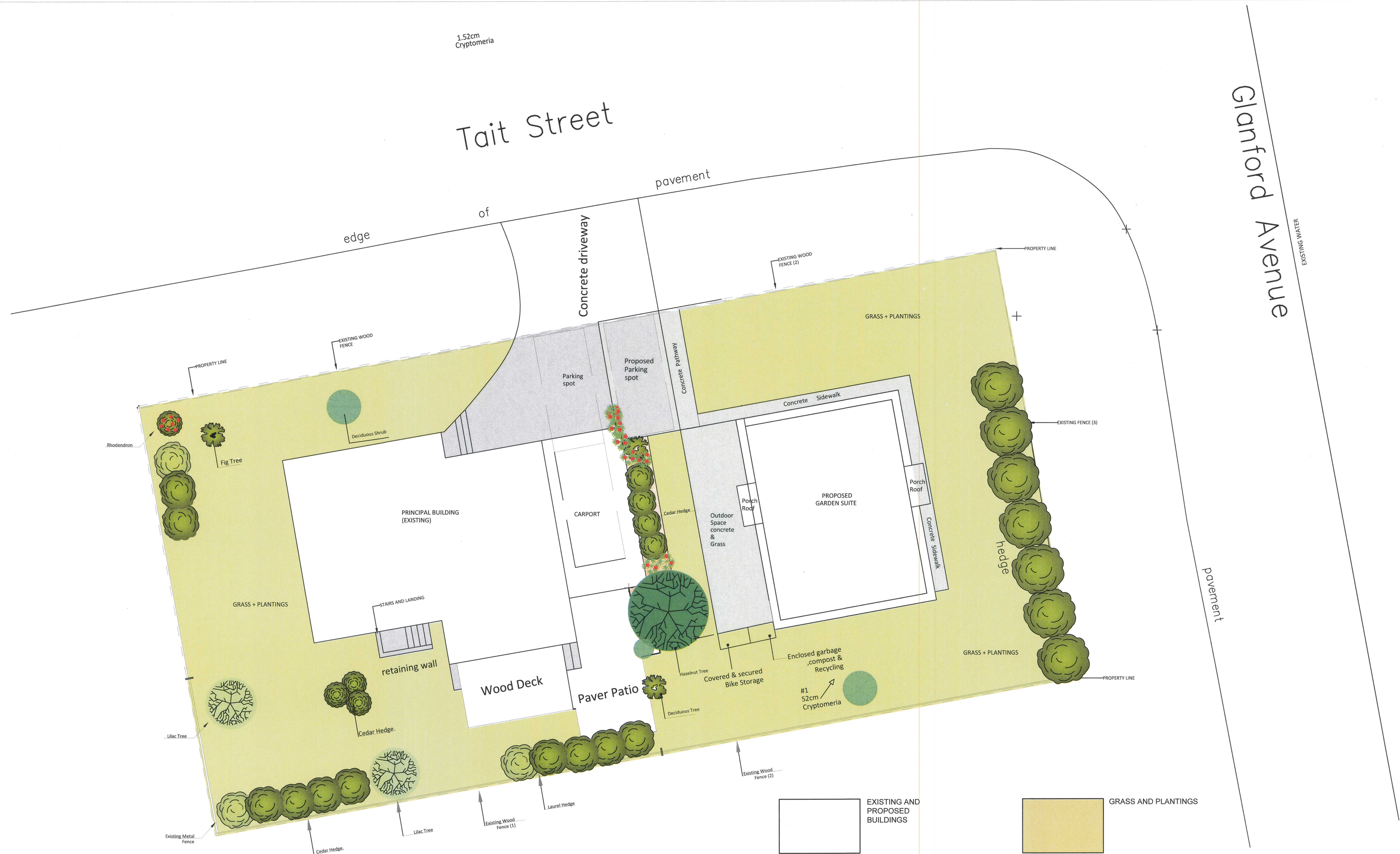
1 LANDSCAPE PLAN P.600 1:100