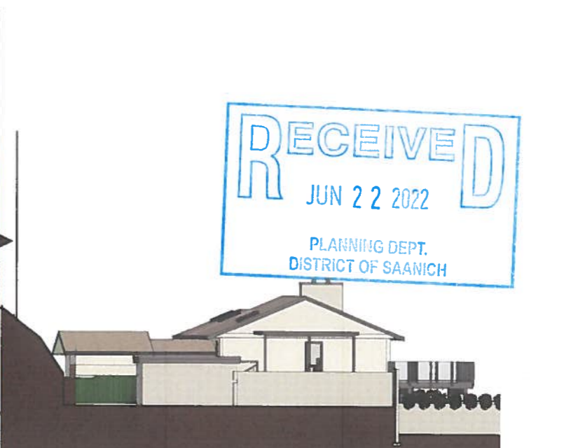
LOT C 5070 CATALINA TERRACE