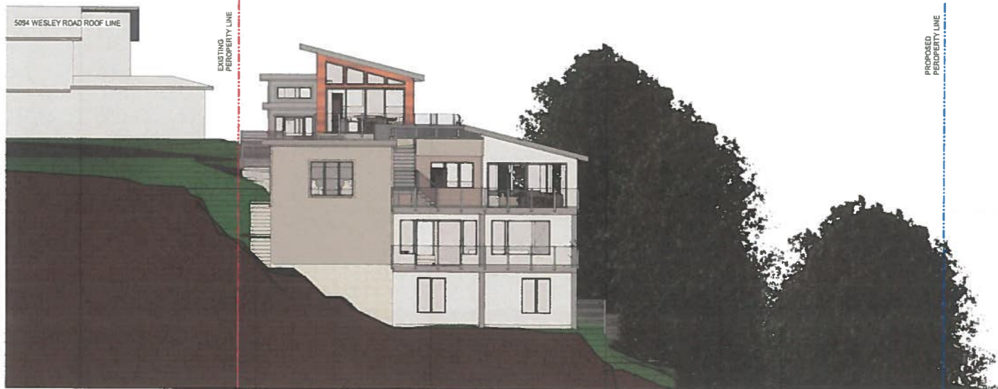
2 Development Elevations - East 3/32" = 1'-0" LOT B 5070 CATALINA TERRACE