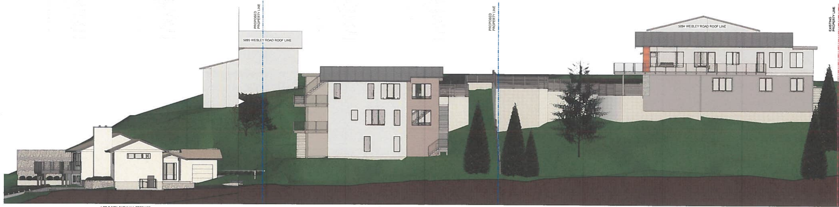
1 Development Elevation - North 3/32" = 1'-0" LOT C 5070 CATALINA TERRACE LOT B 5070 CATALINA TERRACE LOT A 5070 CATALINA TERRACE