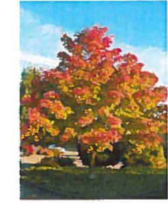
B: DUPPLIN ROAD TREE Acer truncatus x A. platanoides 'Warrensred' Pacific Sunset® Maple