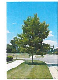
A: TENNYSON AVENUE STREET TREE Platanus x acerifolia 'Bloodgood' Bloodgood London Plane