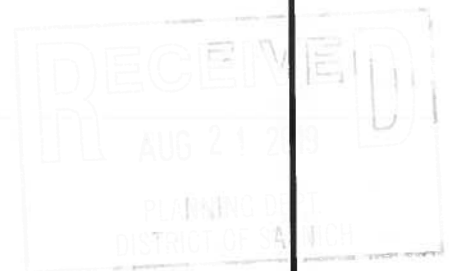
4585 Cordova Bay Road Proposed House 'B'