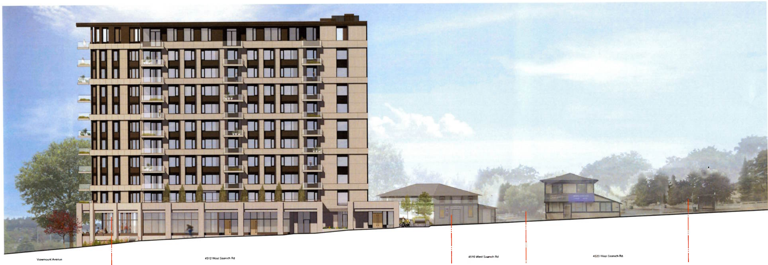
1 West Saanich Rd. Street Elevation

THIS DOCUMENT HAS BEEN ELECTRONICALLY CERTIFIED WITH DIGITAL CERTIFICATES AND ENCRYPTION TECHNOLOGY AUTHORIZED BY THE AEC. THE AUTHENTICATIVE ORIGINAL IS IN ELECTRONIC FORM. ANY PRINTED VERSION CAN BE RELIED UPON AS A TRUE COPY OF THE ORIGINAL, WHEN SUPPLIED BY D'AMBROSIO architecture + urbanism, BEARING IMAGES OF THE PROFESSIONAL SEAL AND DIGITAL CERTIFICATE OR, WHEN PRINTED FROM THE DIGITALLY CERTIFIED ELECTRONIC FILE.