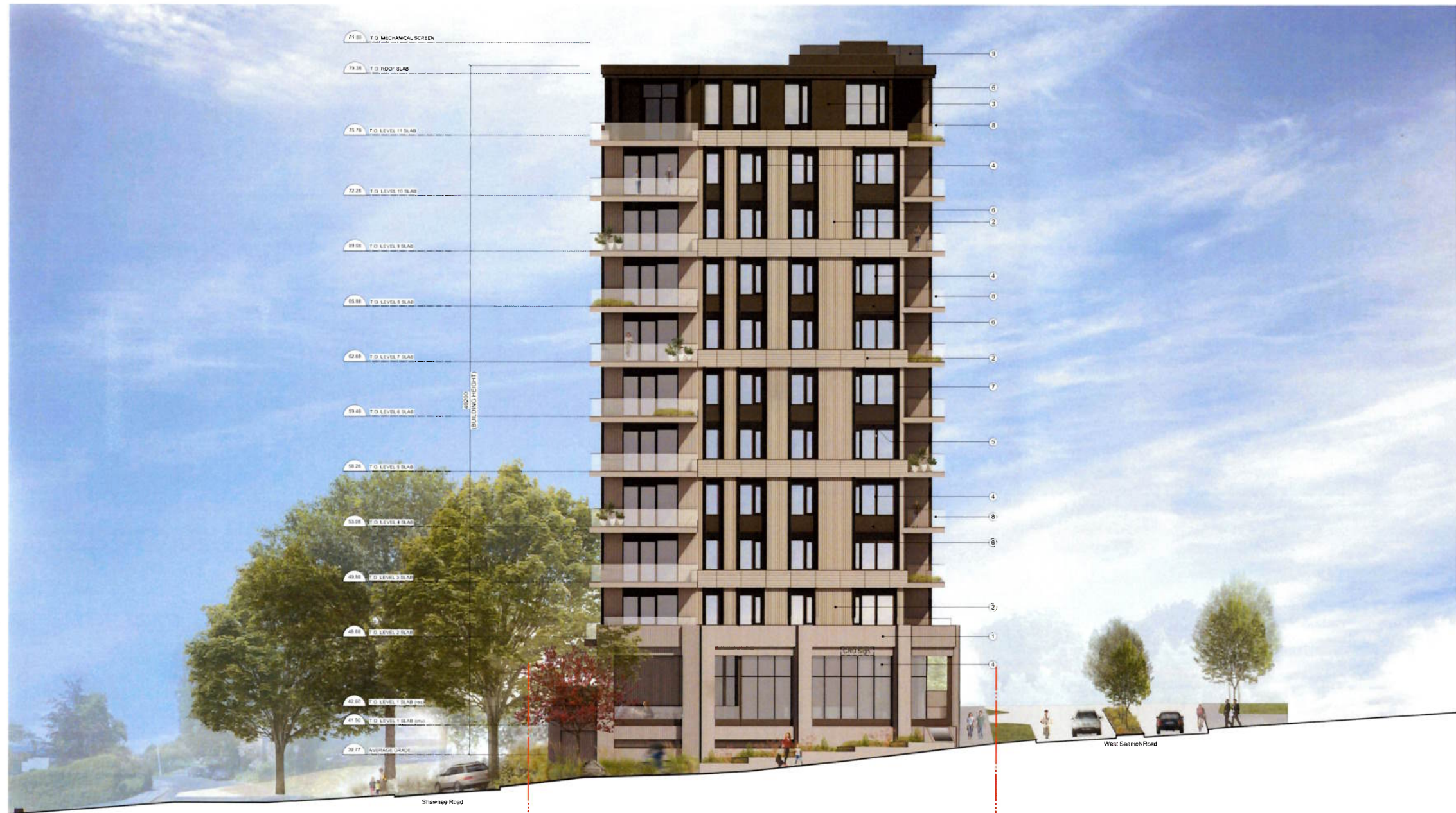
1 South Elevation Scale: 1/8" = 1'-0"