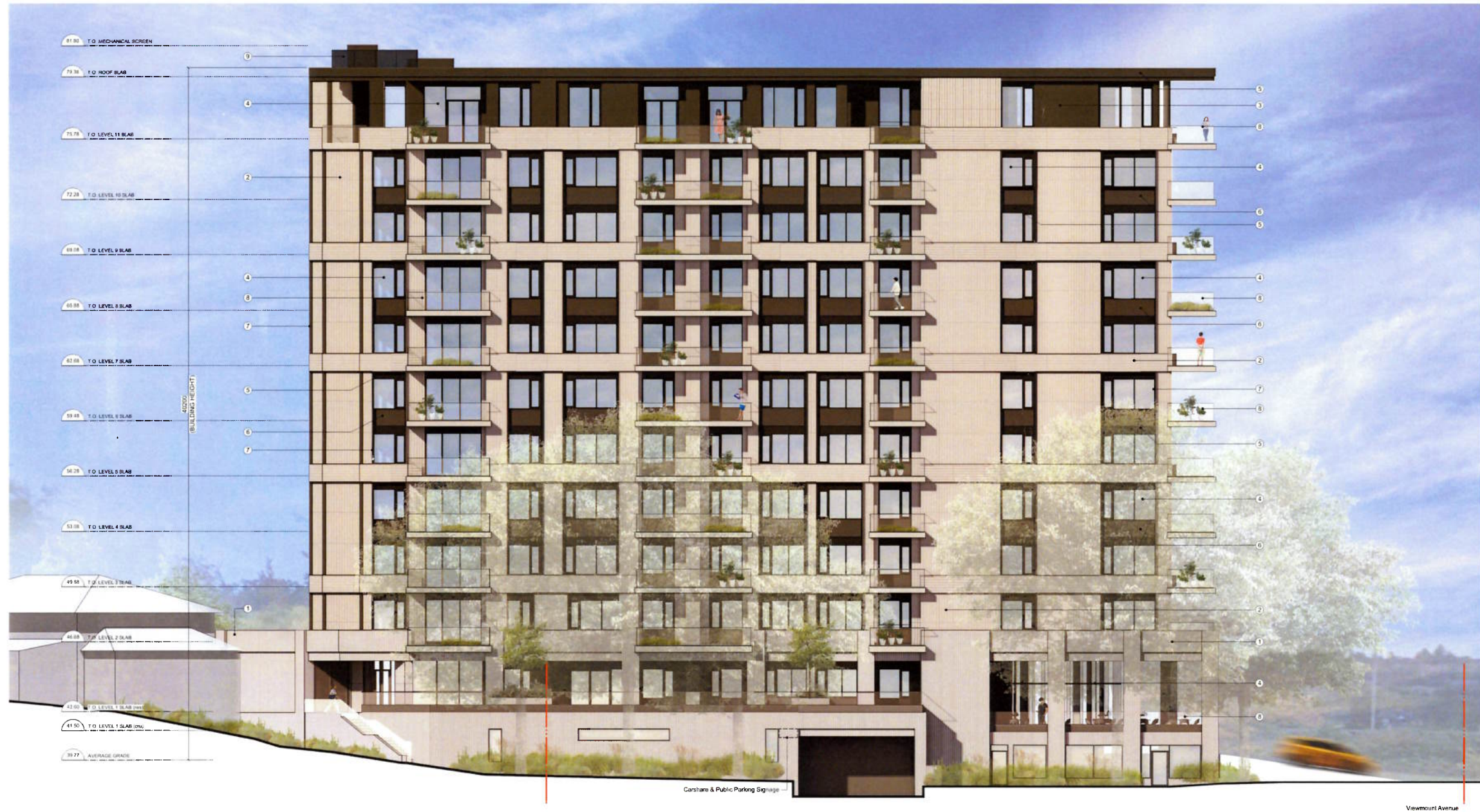
1 West Elevation Scale: 1/100