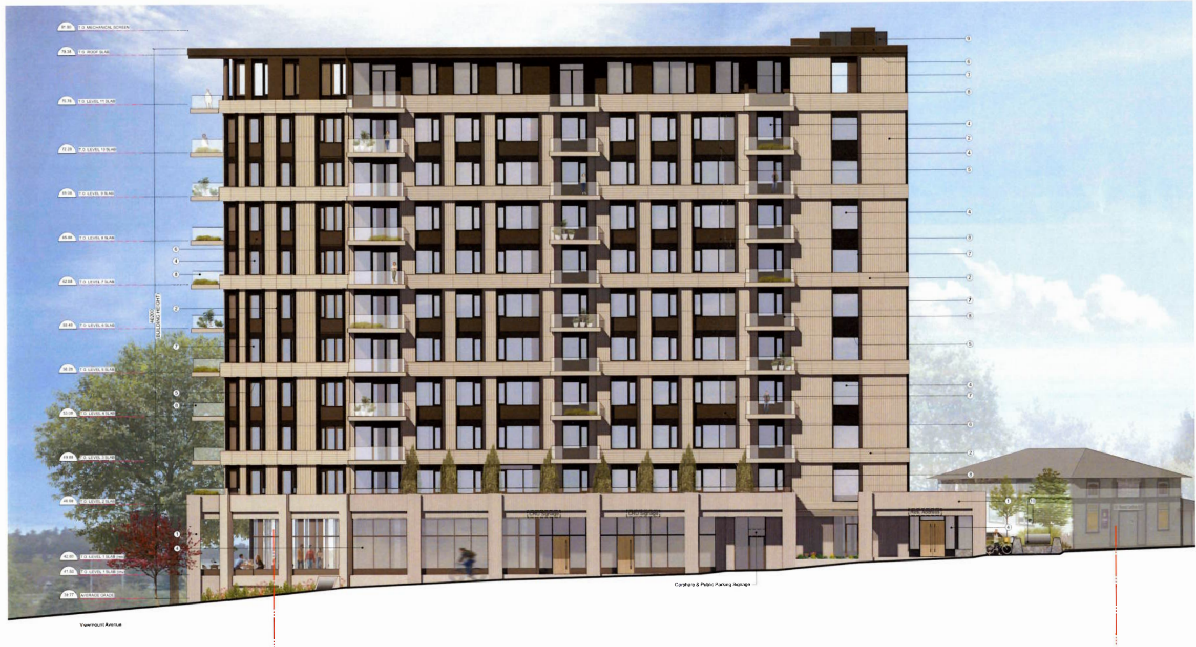
1 East Elevation Scale: 1/100