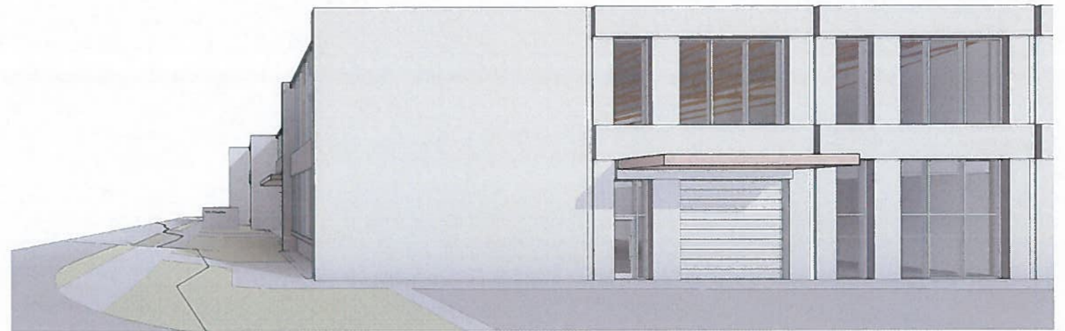
2 Perspective View - To South Entrance SCALE =