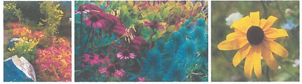
PERENNIALS & SHRUB PLANTINGS