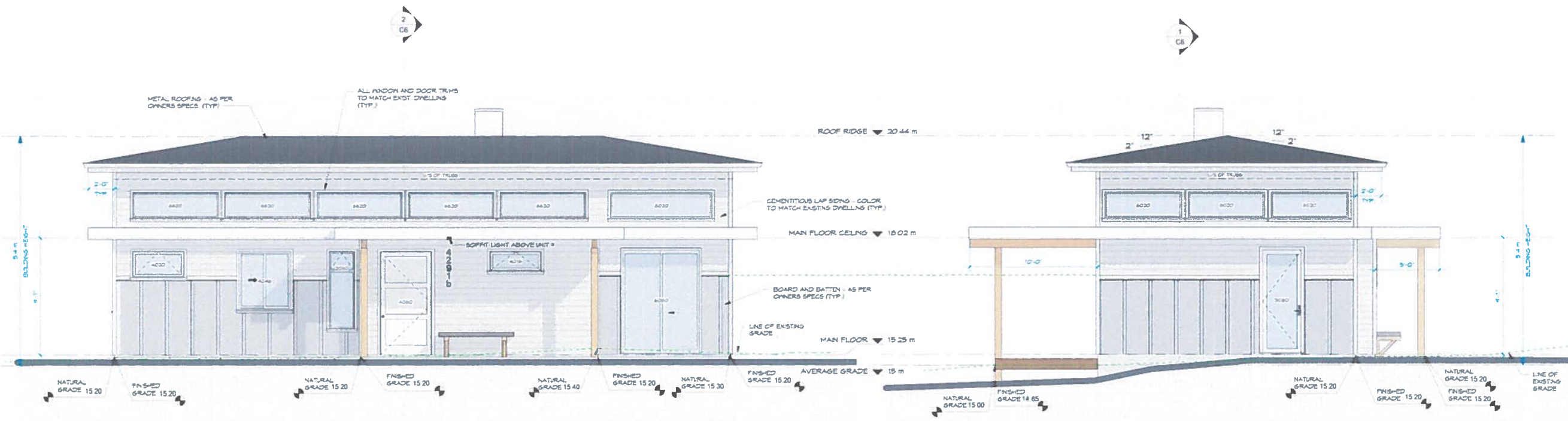
1 FRONT (WEST) 1/4" = 1'-0"

C:\Users\Hitesh Parekh\Google Drive (villawork18@gmail.com)\DESIGN ONL\Y4291 GORDON HEADVA - Design\99 - REVIT models\4291 Gordon Head Rd DP.rvt