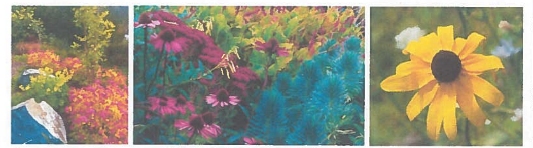
PERENNIALS & SHRUB PLANTINGS