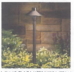
LOW VOLTAGE LANDSCAPE LED LIGHTING