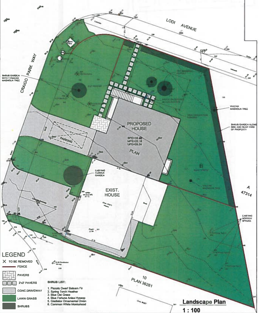
Landscape Plan 1 : 100