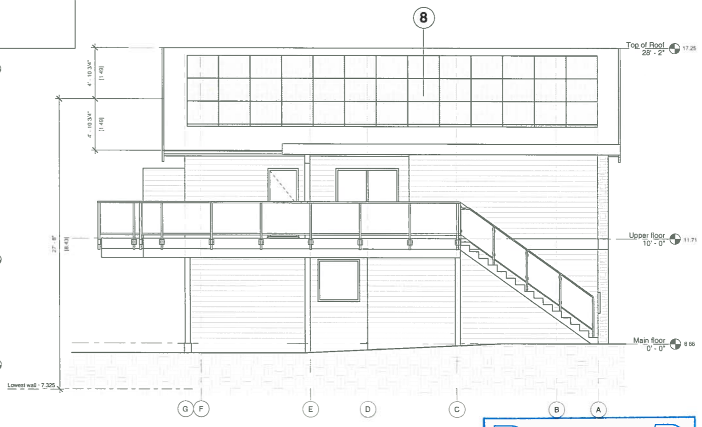
LEFT SIDE ELEVATION (SOUTH) 1/4" = 1'-0"