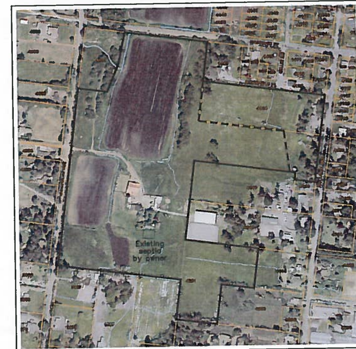
KEY PLAN Scale 1:5000 0 50 100 200 300 400 500