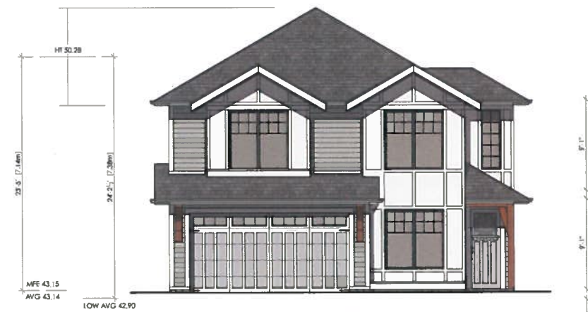
west elevation (lasalle)

HT 50.28 29.5' (7.46m) 24.25' (7.39m) MFE 43.15 AVG 43.14 LOW AVG 42.90