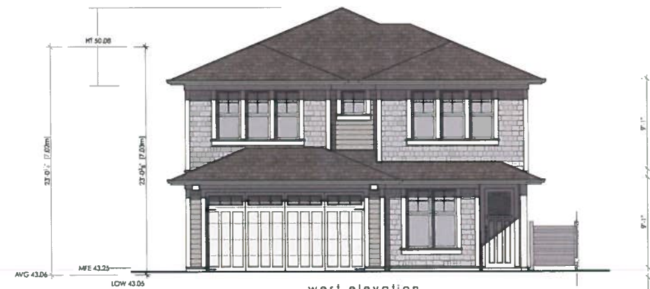
west elevation (lasalle)

HT 50.28 28.0' (7.62m) 27.0' (7.62m) AVG 43.06 MFE 43.25 LOW 43.05