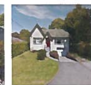
3939 Lasalle St.