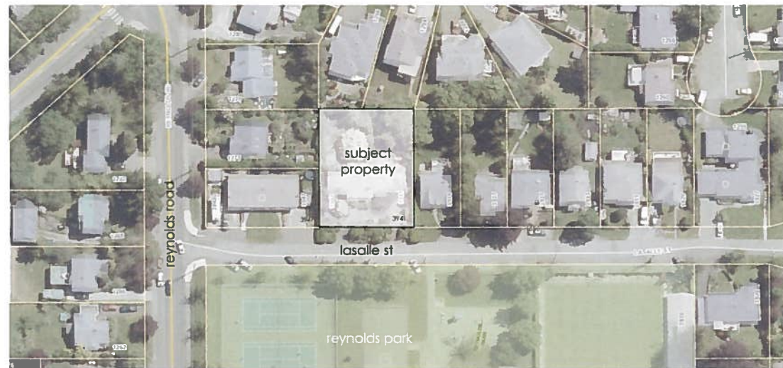
4 Location Map A1 Scale: 1:800