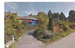
3943 Lasalle St. (Subject Property)