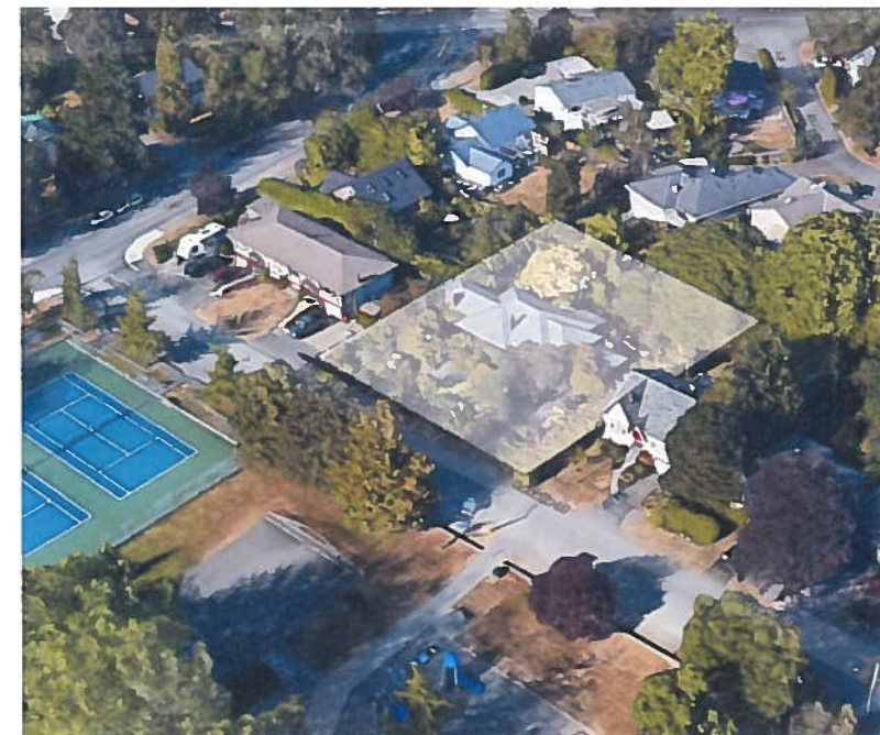
3 Location - Aerial Isometric A1