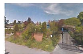
3941 Lasalle St. (Subject Property)