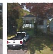
3937 Lasalle St.