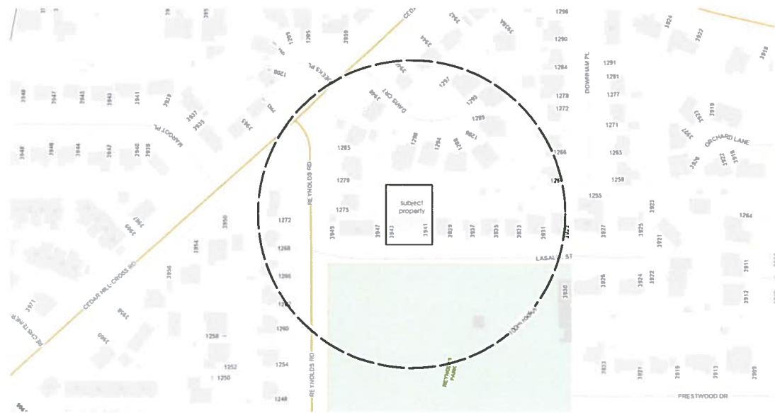
2 Location Map A1 Scale: 1:1600

Proposed Lot 2 Lot Area = 6329 ft2 / 588 m2 Lot Coverage = 1660 ft2 / 154.2 m2 / 26.2% Main Floor Area (Garage Ex) = 1073 ft2 / 99.68 m2 Upper Floor Area = 1208 ft2 / 112.23 m2 Basement Floor Area = 877 ft2 / 81.48 m2 Total Floor Area = 3158 ft2 / 293.39 m2 / FAR 0.499/1 Non Basement Floor Area = 2281 ft2 / 211.91 m2 72.1% of Allowable Area Building Height - From Avg. = 7.02m From Low Avg. = 7.03m See Plan for Setback Information