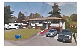
3947 / 3949 Lasalle St.