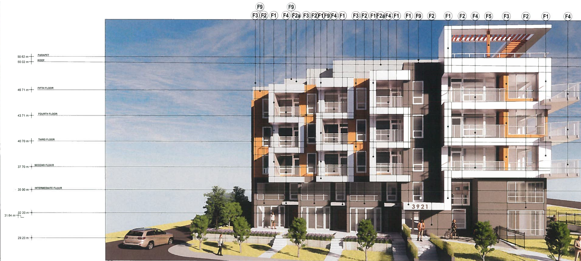
1 WEST ELEVATION, ALONG ST. PETERS A3.1 SCALE 1/8" = 1'-0"