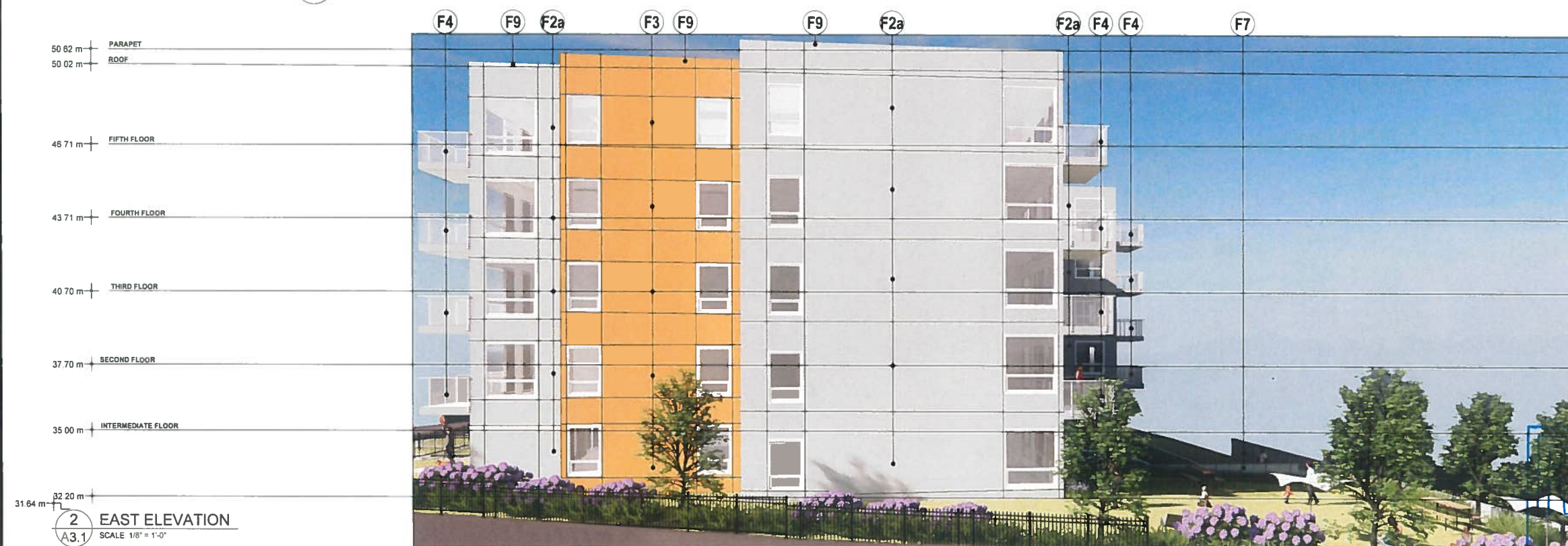
2 EAST ELEVATION A3.1 SCALE 1/8" = 1'-0"