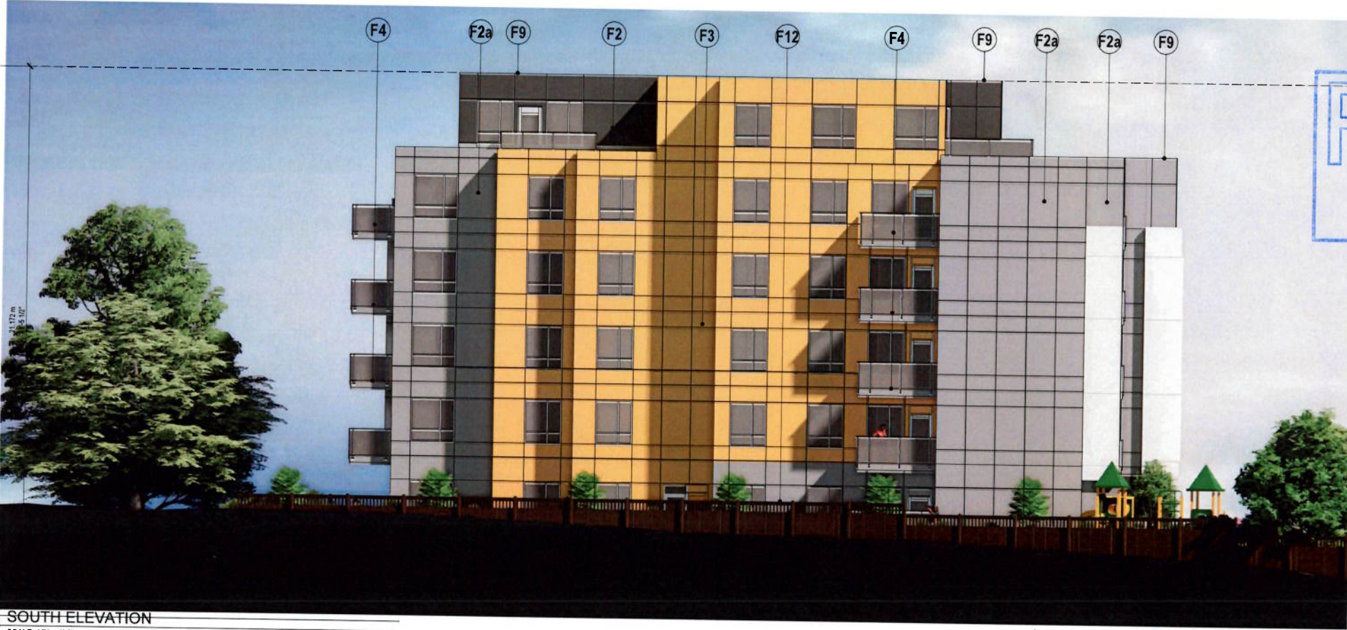
2 SOUTH ELEVATION SCALE: 1/8" = 1'-0"

AVERAGE GRADE 32.7m GEO GROUND FL (LOW) 32.5m GEO 0 m (0'-0") PROJECT