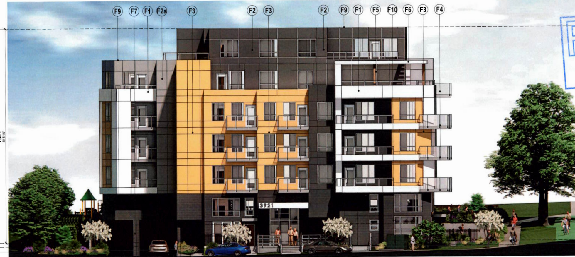
2 NORTH ELEVATION, ALONG ST. PETER ST. A3.0 SCALE 1/8" = 1'-0"

RECEIVED NOV 20 2024 PLANNING DEPT. DISTRICT OF SAANICH