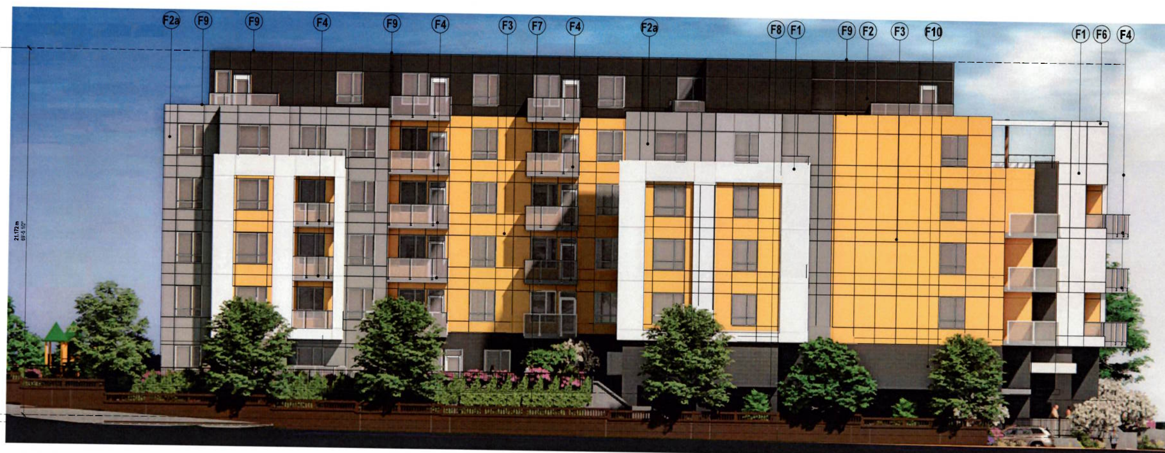
1 EAST ELEVATION SCALE: 1/8" = 1'-0"

AVERAGE GRADE 32.7m GEO GROUND FL (LOW) 32.5m GEO 0 m (0'-0") PROJECT