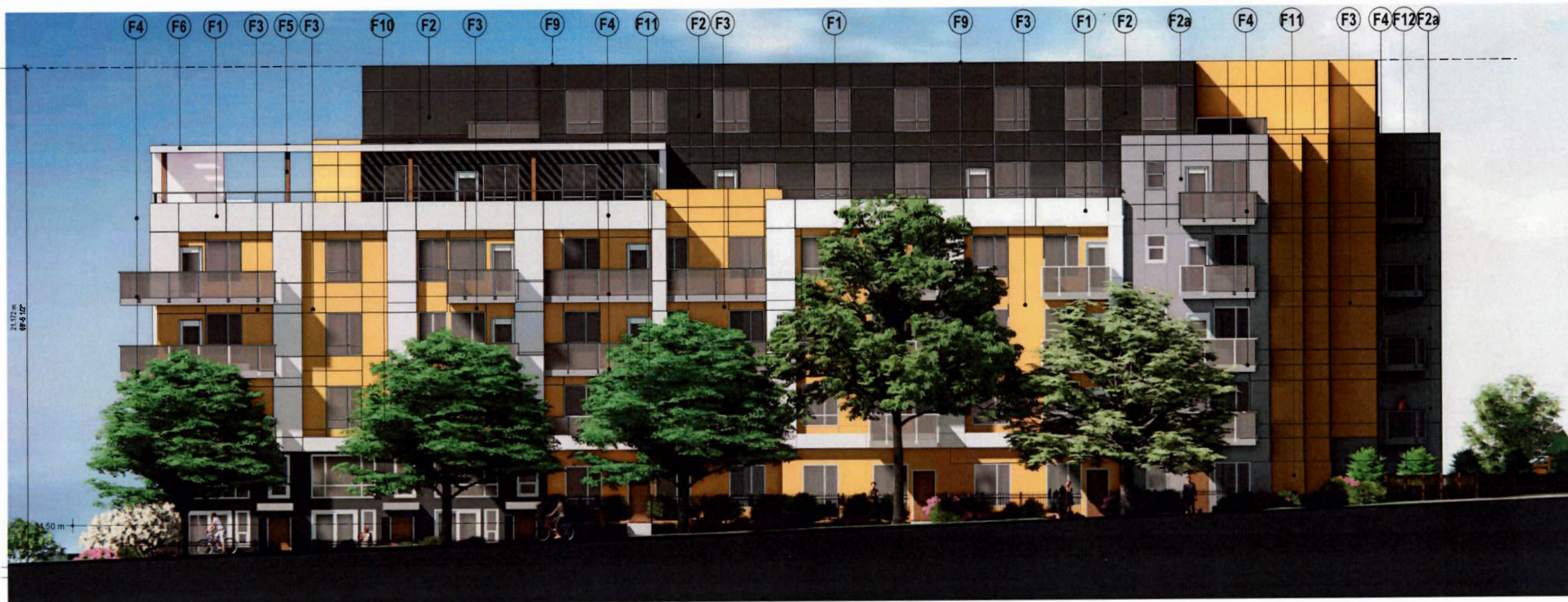
1 WEST ELEVATION, ALONG QUADRA STREET A3.0 SCALE 1/8" = 1'-0"

Copyright Reserved. These drawings are at all times the property of the Architect. Reproduction in whole or in part without written consent of the Architect is prohibited.