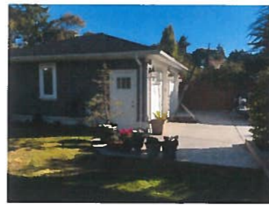
Existing Accessory Garage, View to North