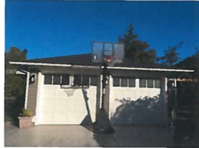
Existing Accessory Garage, View to Northwest