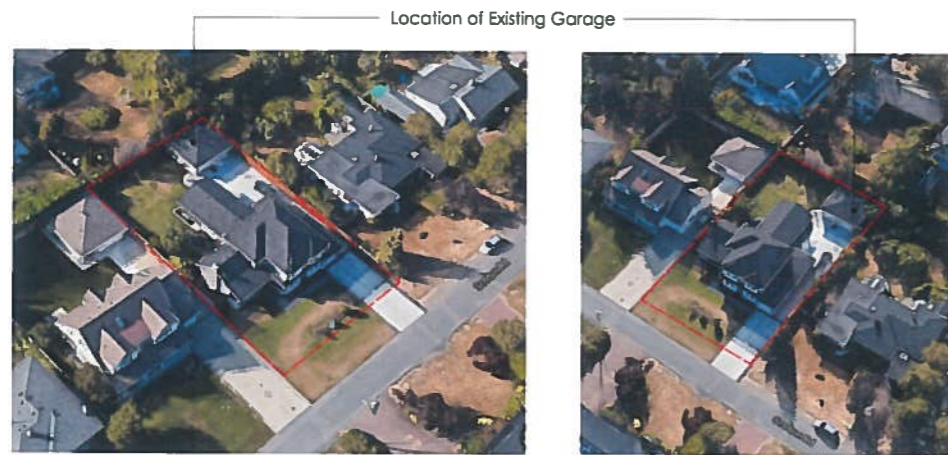
Aerial Views of Subject Property