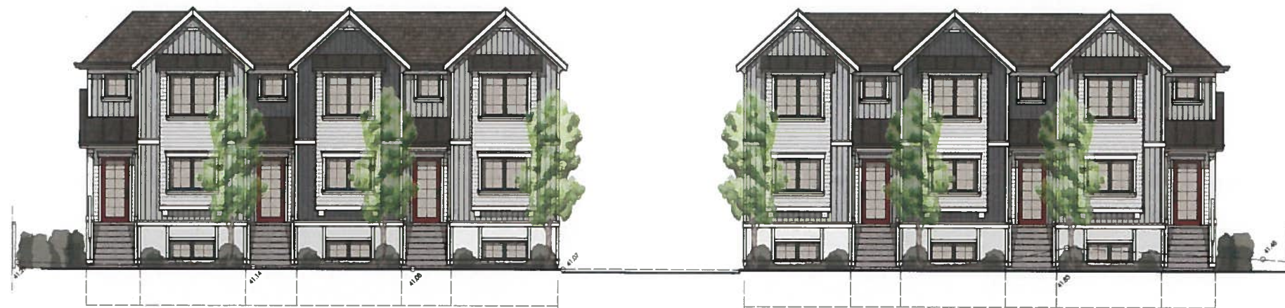
1 West Full Site Elevation (Cedar Hill Rd) A2.2 Scale: 1:100