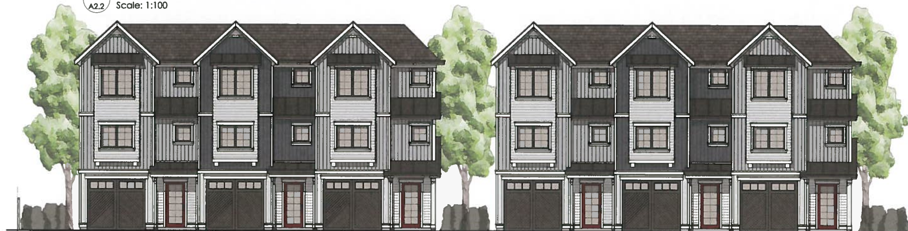
2 West Full Site Elevation (Interior Access) A2.2 Scale: 1:100