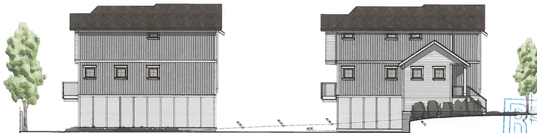
4 North Full Site Elevation A2.2 Scale: 1:100