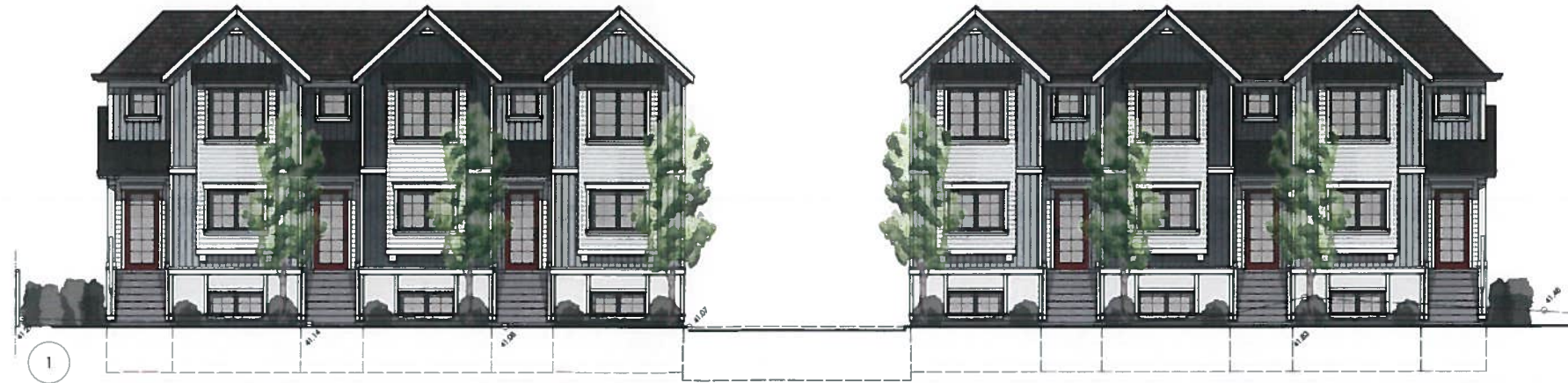
west full site elevation (cedar hill road)