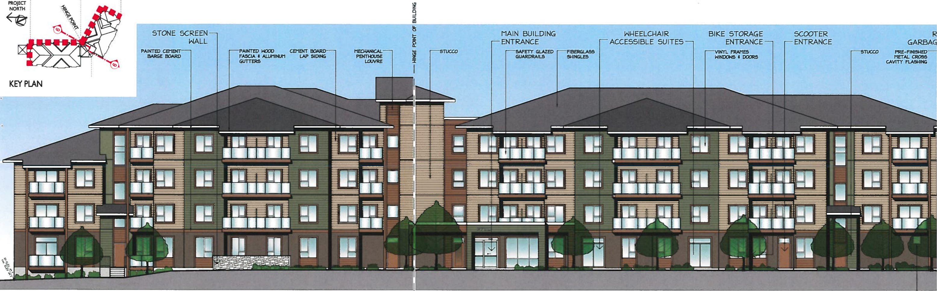
SOUTH WING | SOUTHEAST ELEVATION