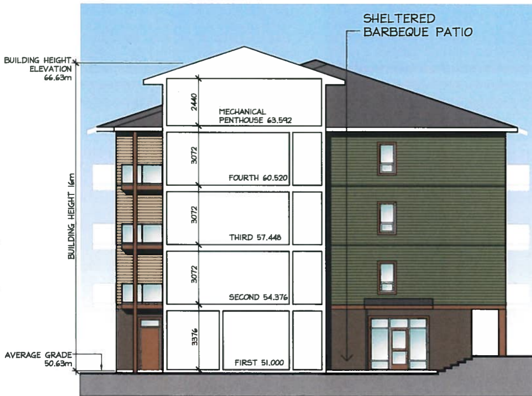
BUILDING SECTION 5