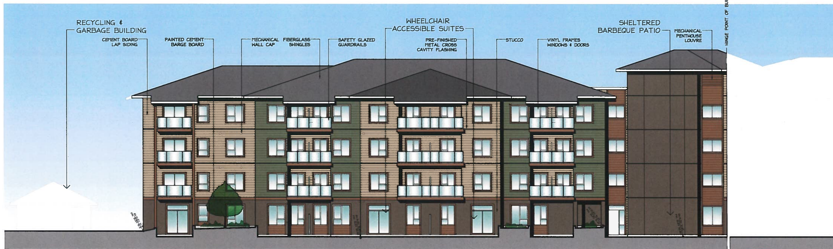
NORTH WING | WEST ELEVATION