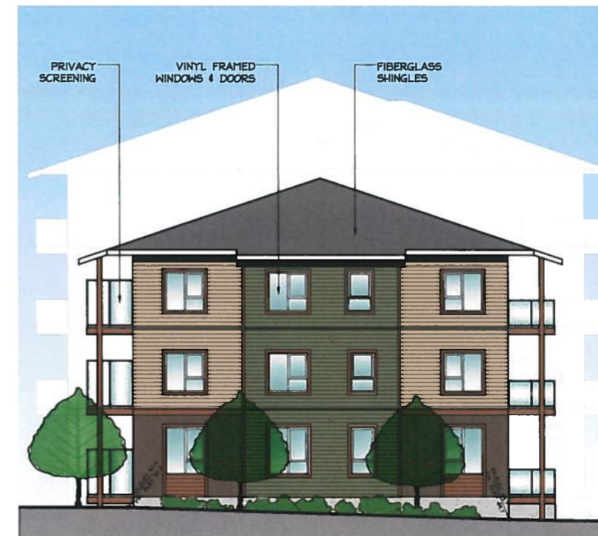
SOUTH WING | SOUTHEAST ELEVATION