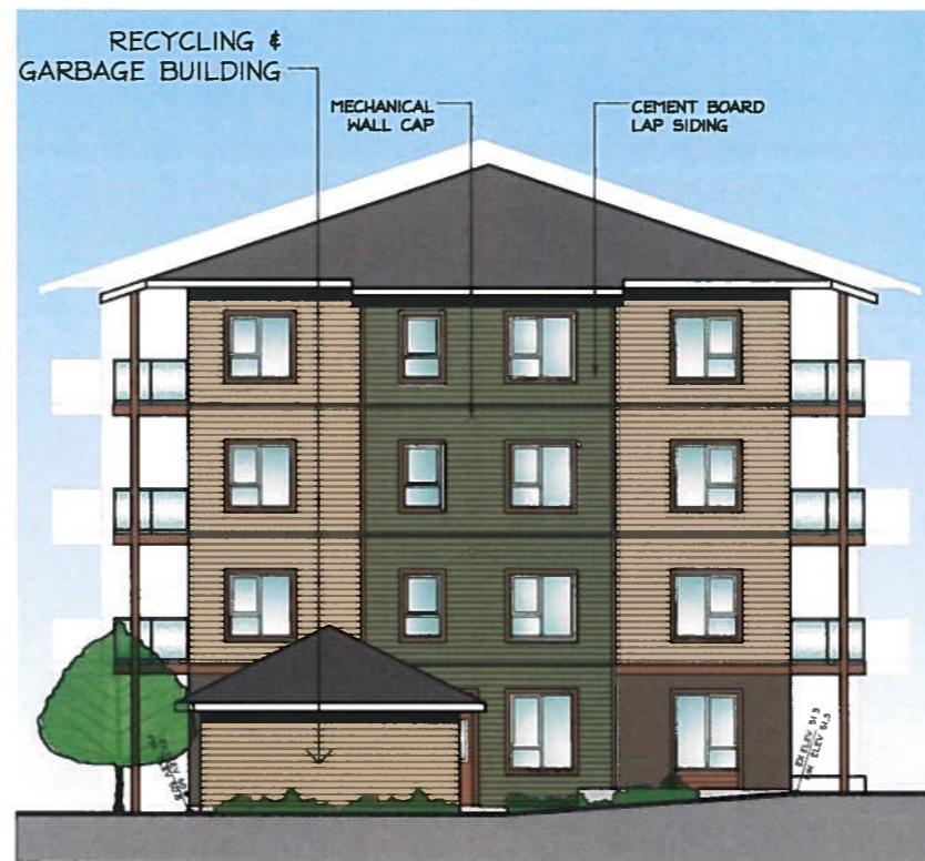
NORTH WING | NORTH ELEVATION