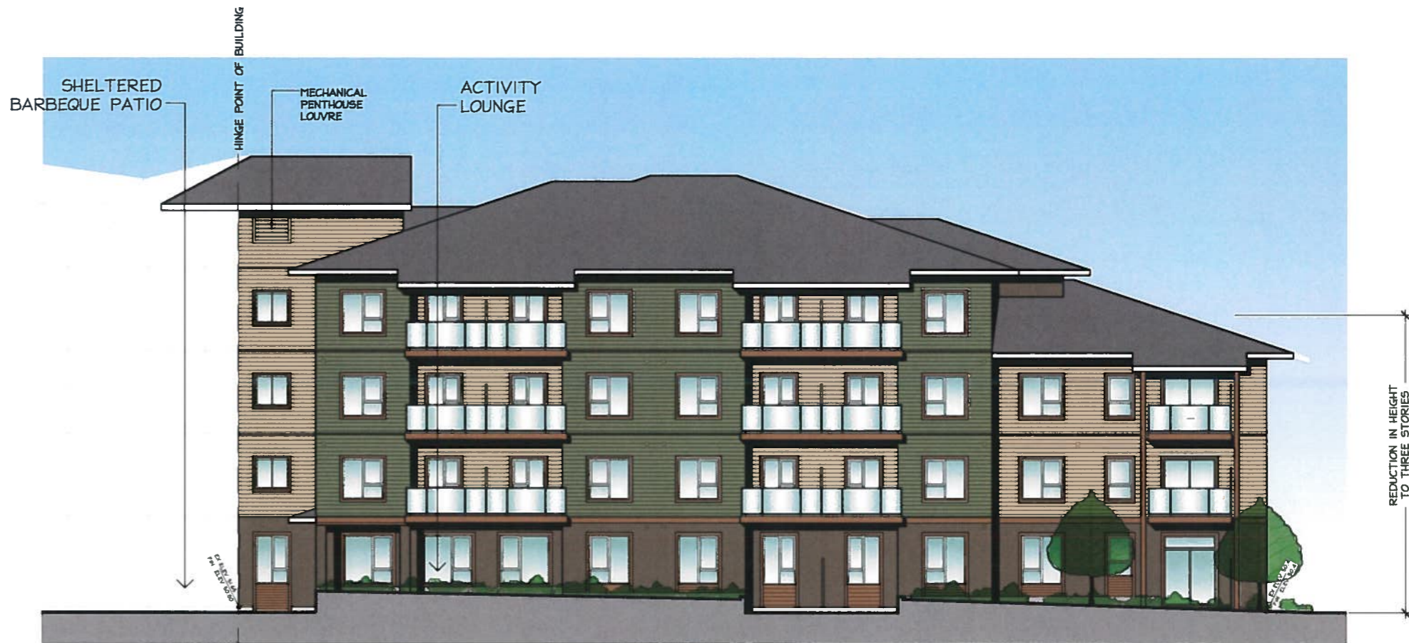
SOUTH WING | SOUTHWEST ELEVATION