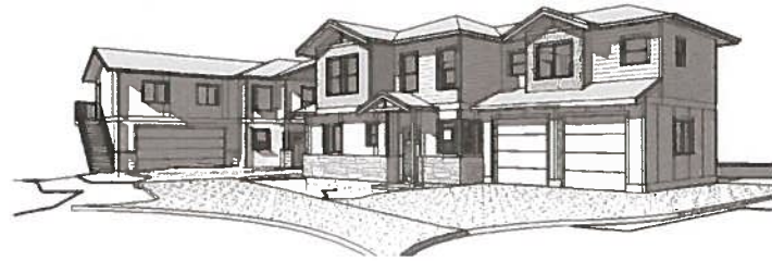
② 3D View 1

max permitted single family dwelling 7.5m (24.6') Proposed: from natural AV'G GRADE 6.73 m from natural L.A.G 6.91 m