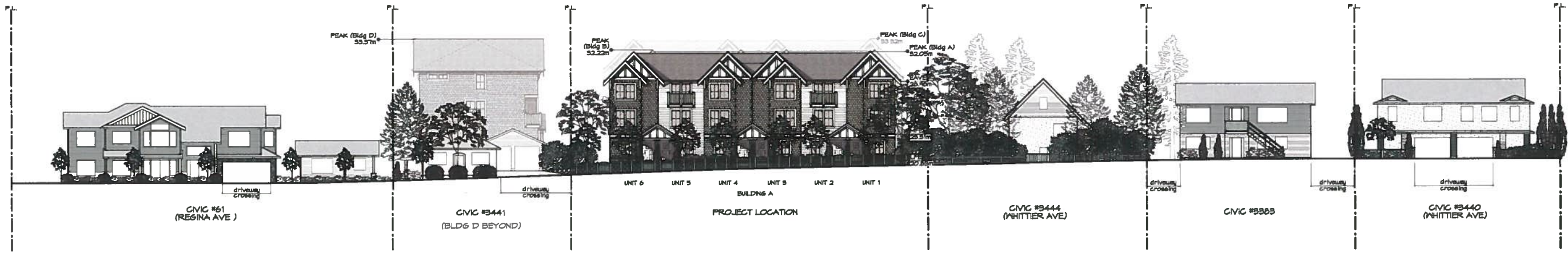
1 Harriet Road Streetscape A401 Scale: 1:200