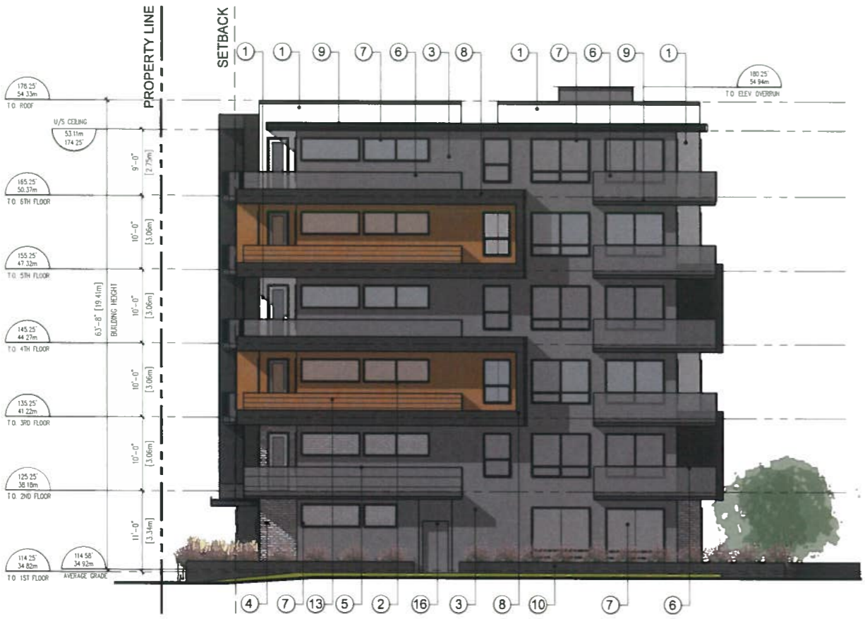
2 SOUTH ELEVATION - CONDO 1/100