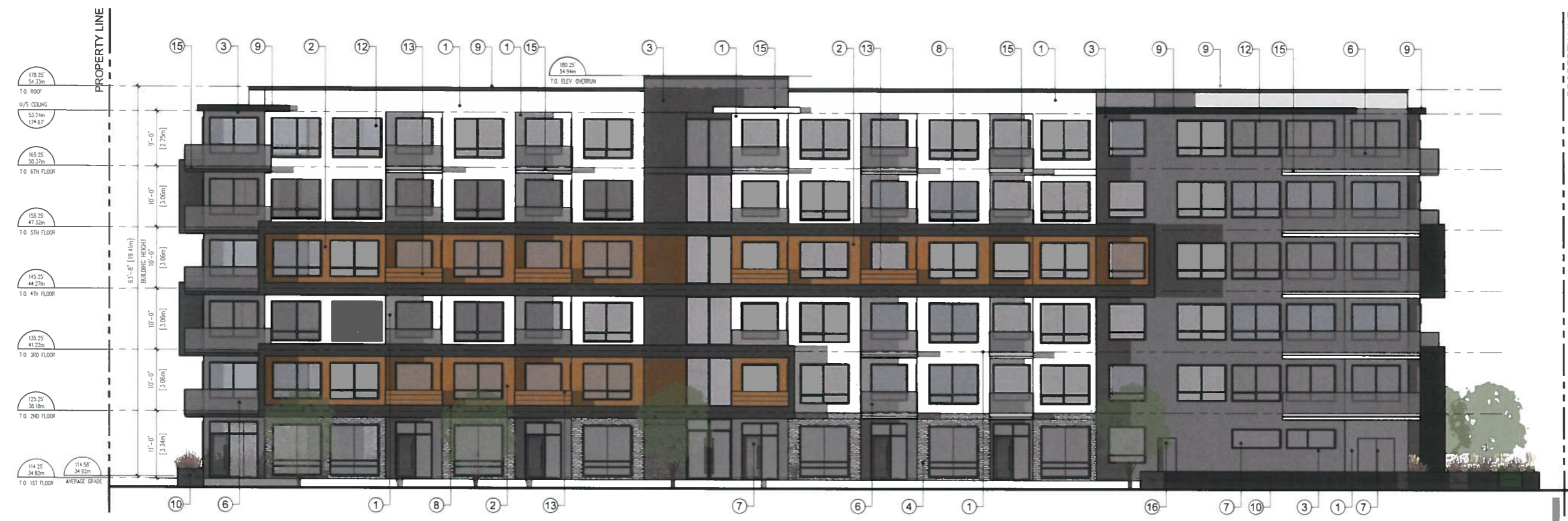
1 EAST ELEVATION - CONDO 1/100

PROJECT NO 19058 DRAWN BY XV SCALE 1:100 REVIEW BY DM DWG NO A302