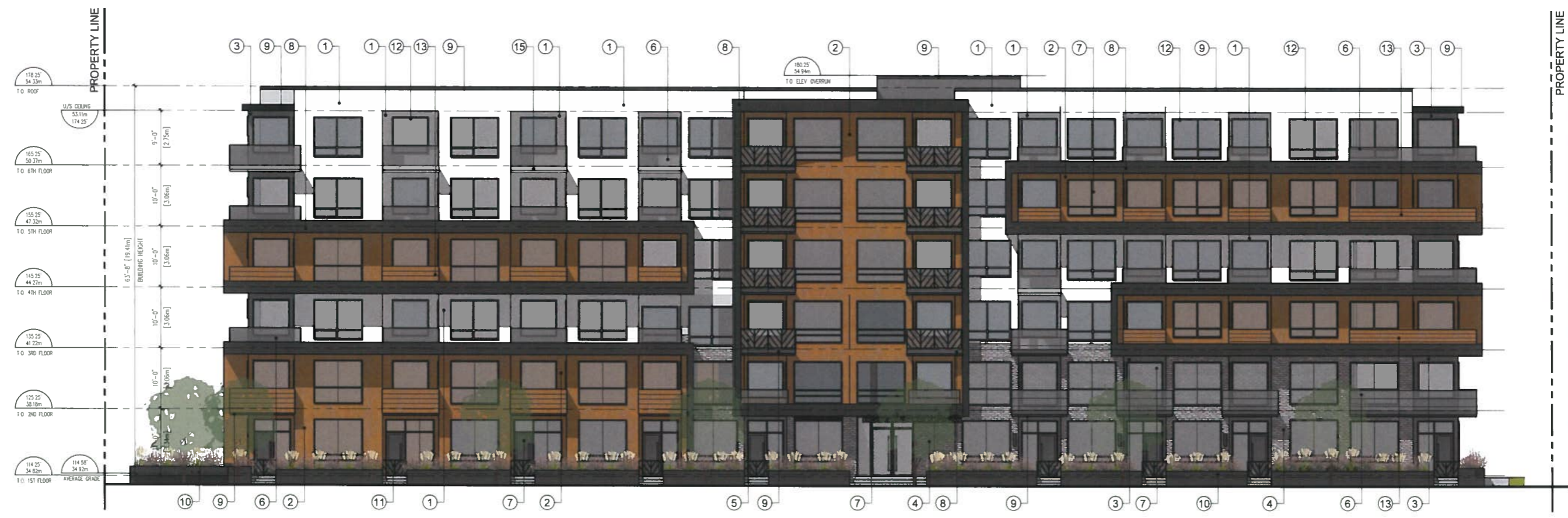
1 WEST ELEVATION - CONDO 1:100

PROJECT NO 19058 DRAWN BY XI SCALE 1:100 REVIEW BY DM DWG NO A301