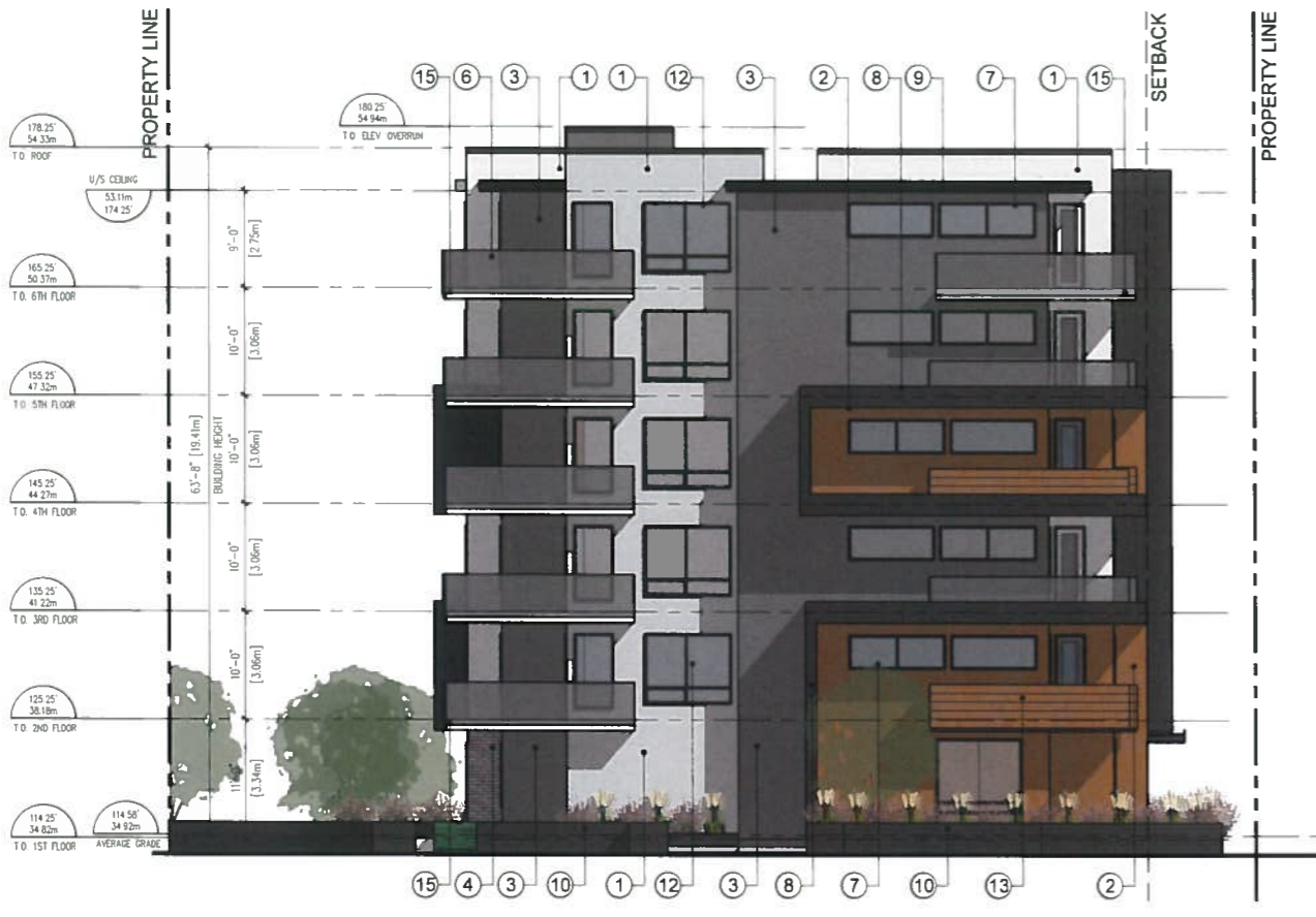
2 NORTH ELEVATION - CONDO 1:100