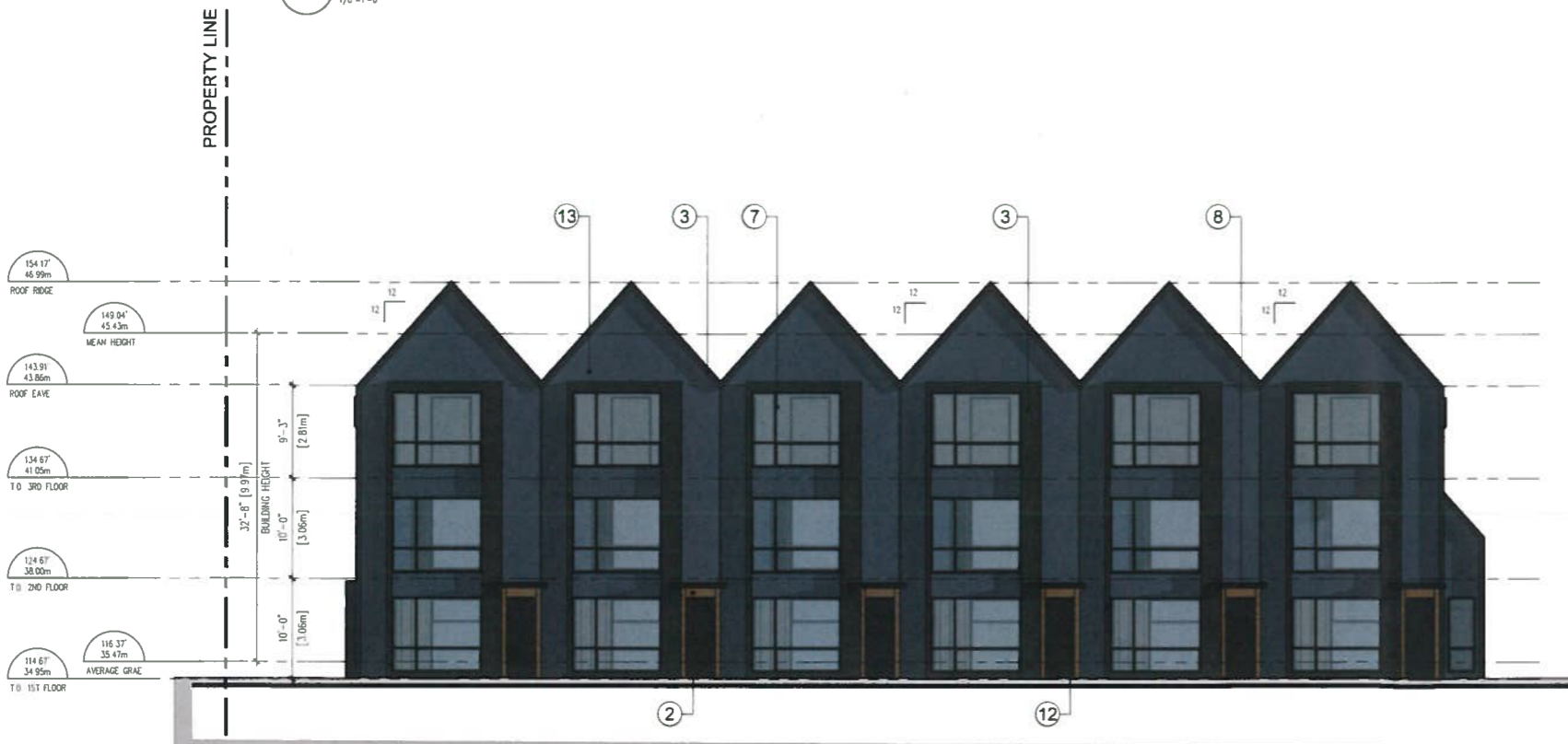
2 EAST ELEVATION - TOWNHOMES 1/8"=1'-0"