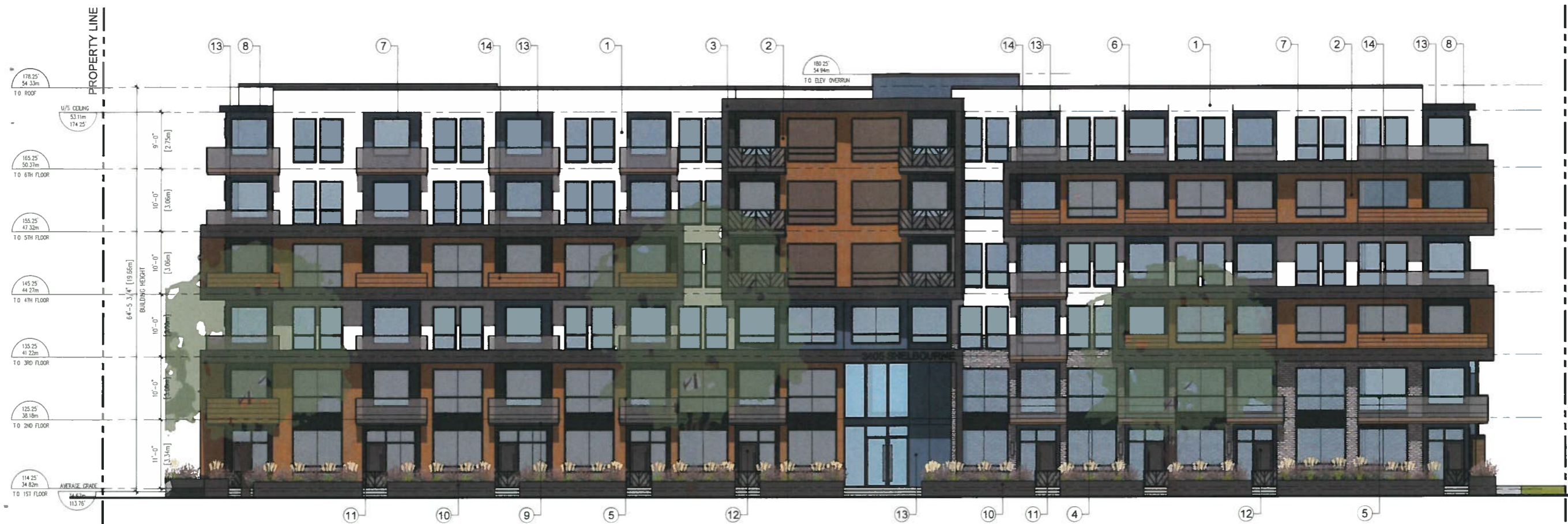
1 WEST ELEVATION - CONDO 1/8"=1'-0"

PROJECT NO 19058 DRAWN BY XV SCALE AS NOTED REVIEW BY DM DWG NO A301