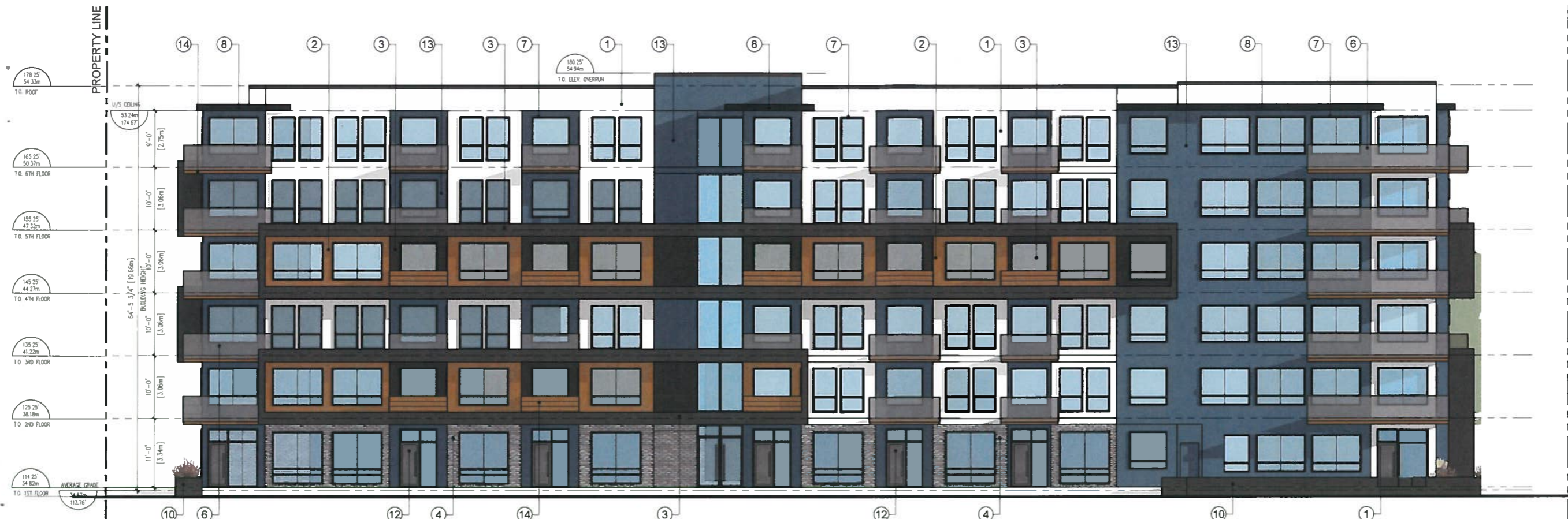
1 EAST ELEVATION - CONDO 1/8"=1'-0"

PROJECT NO 19058 DRAWN BY XV SCALE AS NOTED REVIEW BY DM DWG NO A302