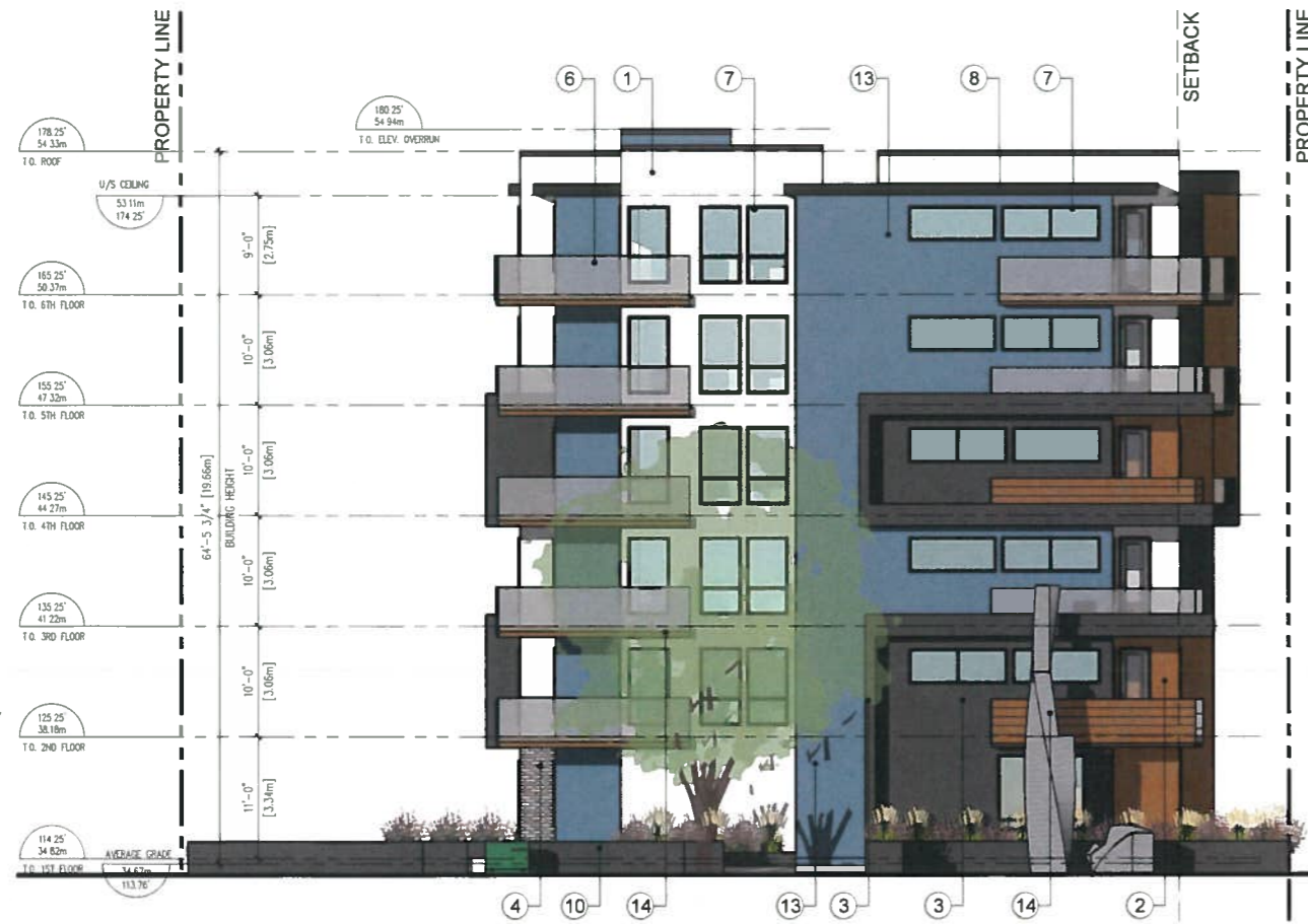
2 NORTH ELEVATION - CONDO 1/8"=1'-0"