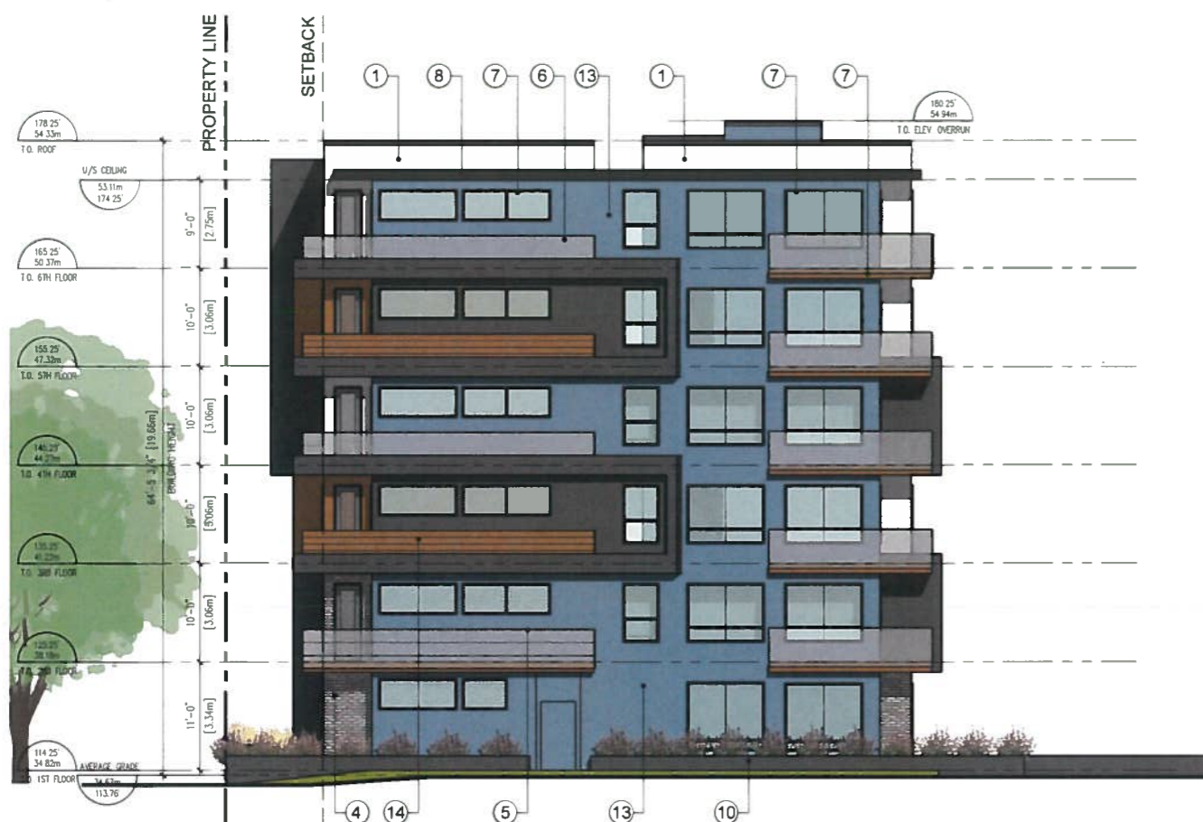
2 SOUTH ELEVATION - CONDO 1/8"=1'-0"