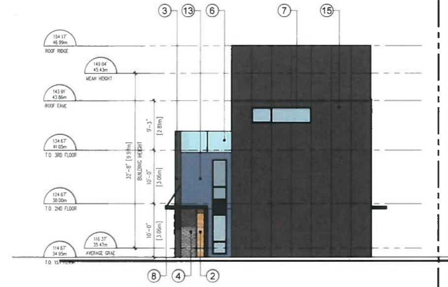
3 SOUTH ELEVATION - TOWNHOMES 1/8"=1'-0"