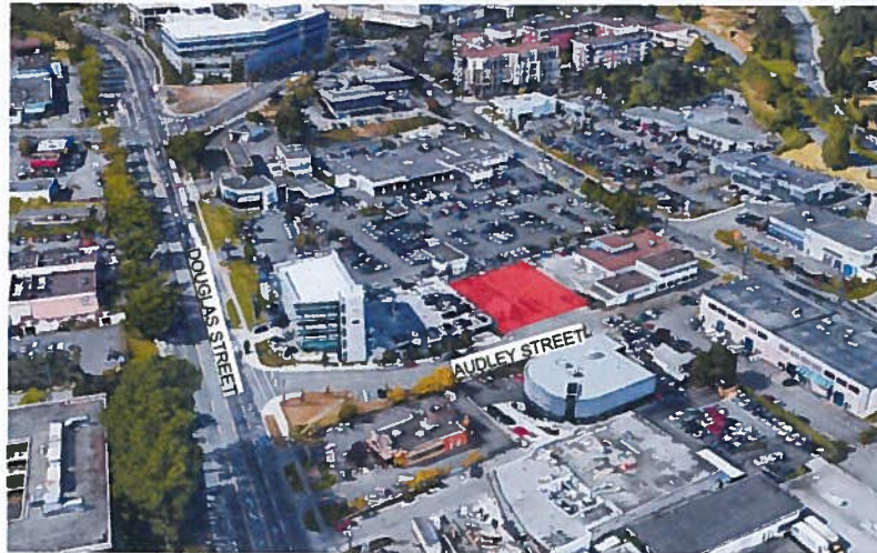
SITE LOCATION - VIEW FROM SOUTH SIDE