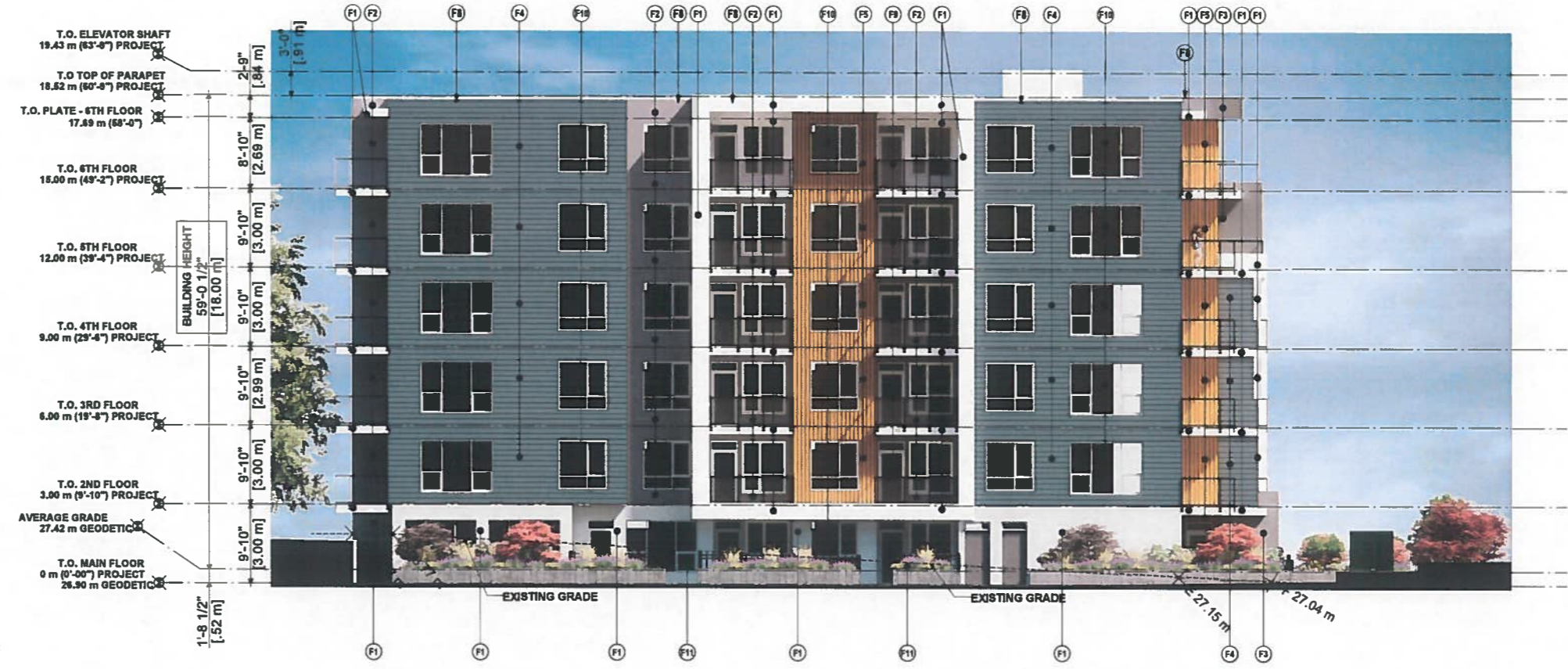
2 EAST ELEVATION A3.1 SCALE: 1:100