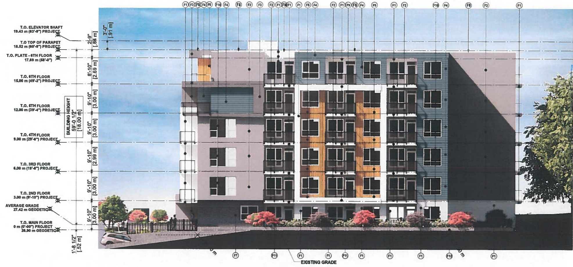
1 WEST ELEVATION A3.1 SCALE: 1:100

RECEIVED JAN 12 2023 PLANNING DEPT. DISTRICT OF SAANICH