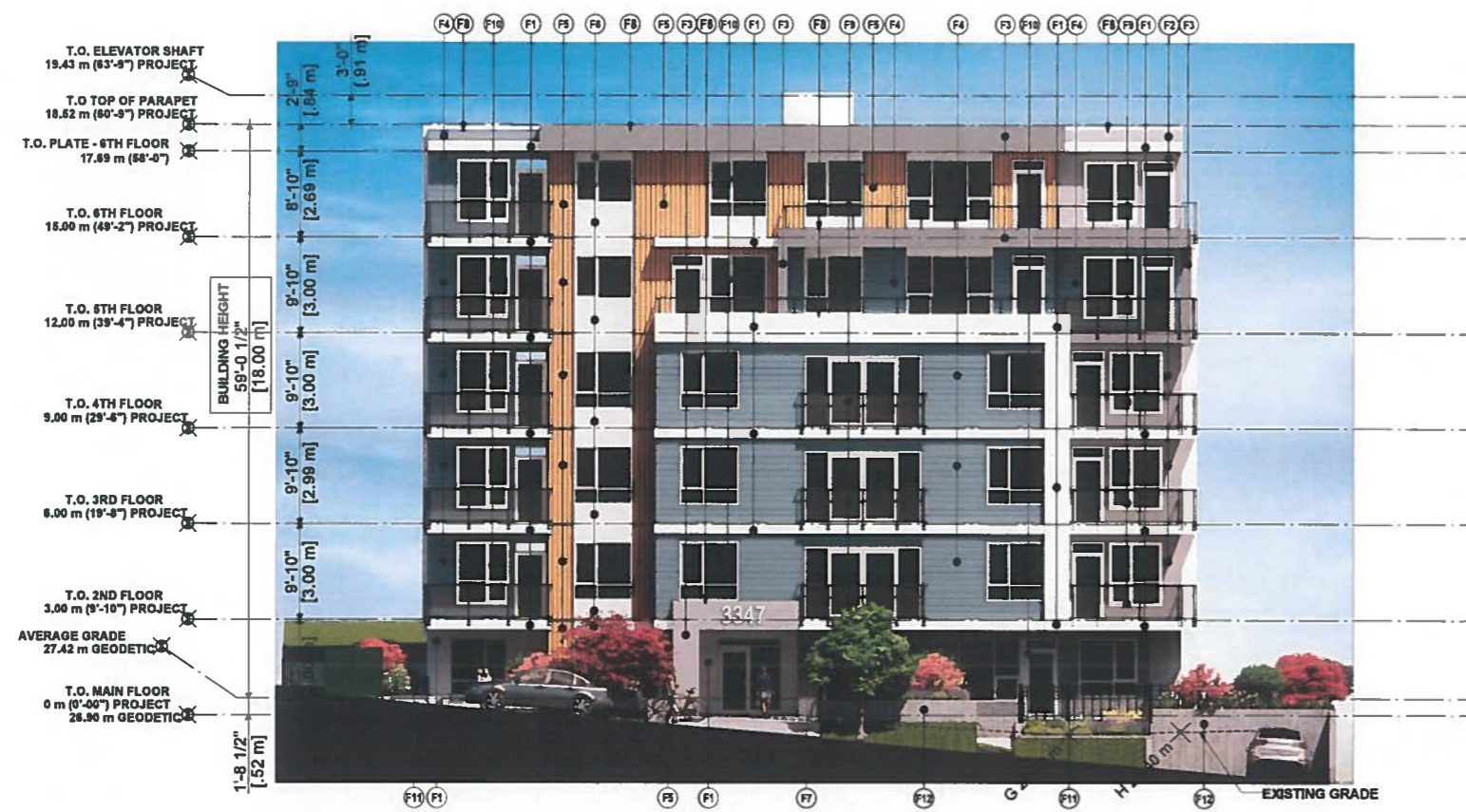
1 FRONT ELEVATION A3.0 SCALE: 1:100

Copyright Reserved: These drawings are at all times the property of the Architect. Reproduction in whole or in part without written consent of the Architect is prohibited.