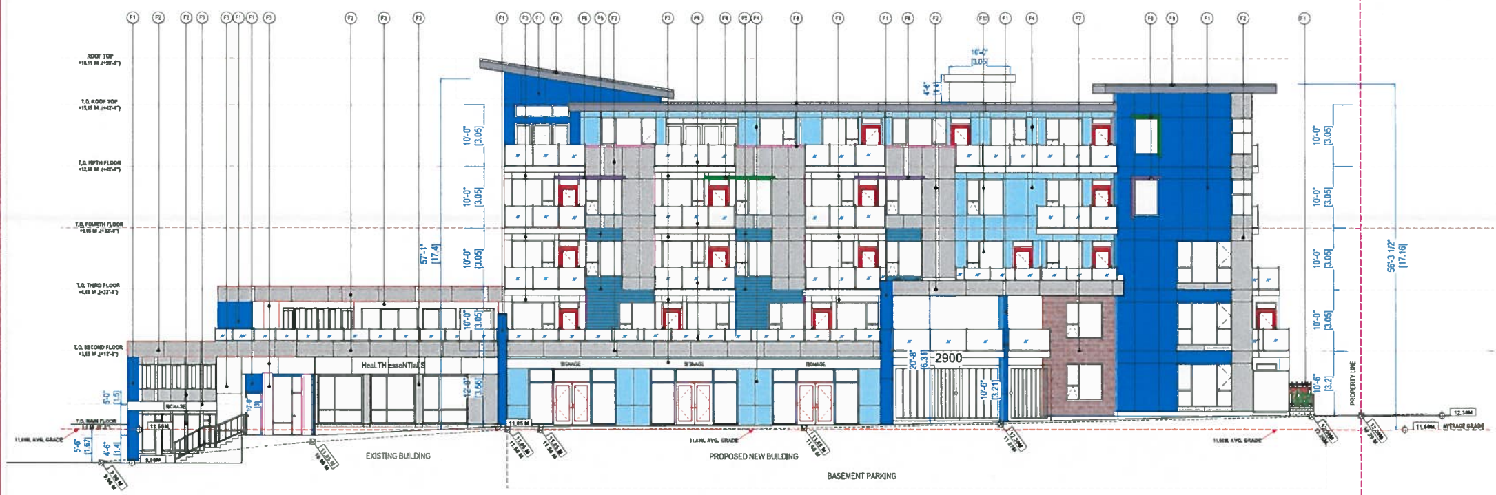
1 SOUTH - EAST ELEVATION SCALE: 1/80

Copyright Reserved. These drawings are at all times the property of the Architect. Reproduction in whole or in part without written consent of the Architect is prohibited.