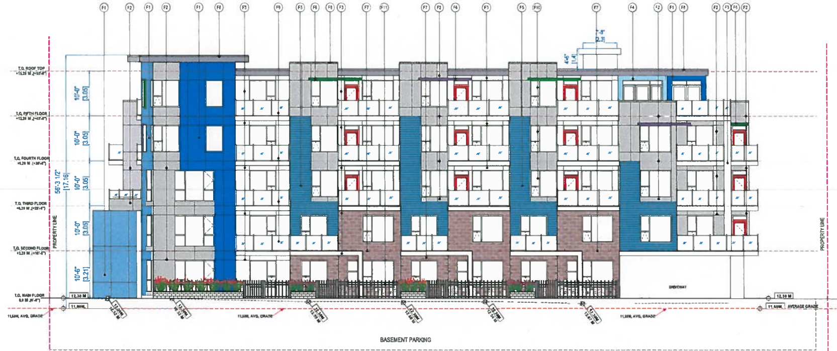
2 NORTH - EAST ELEVATION SCALE: 1/80