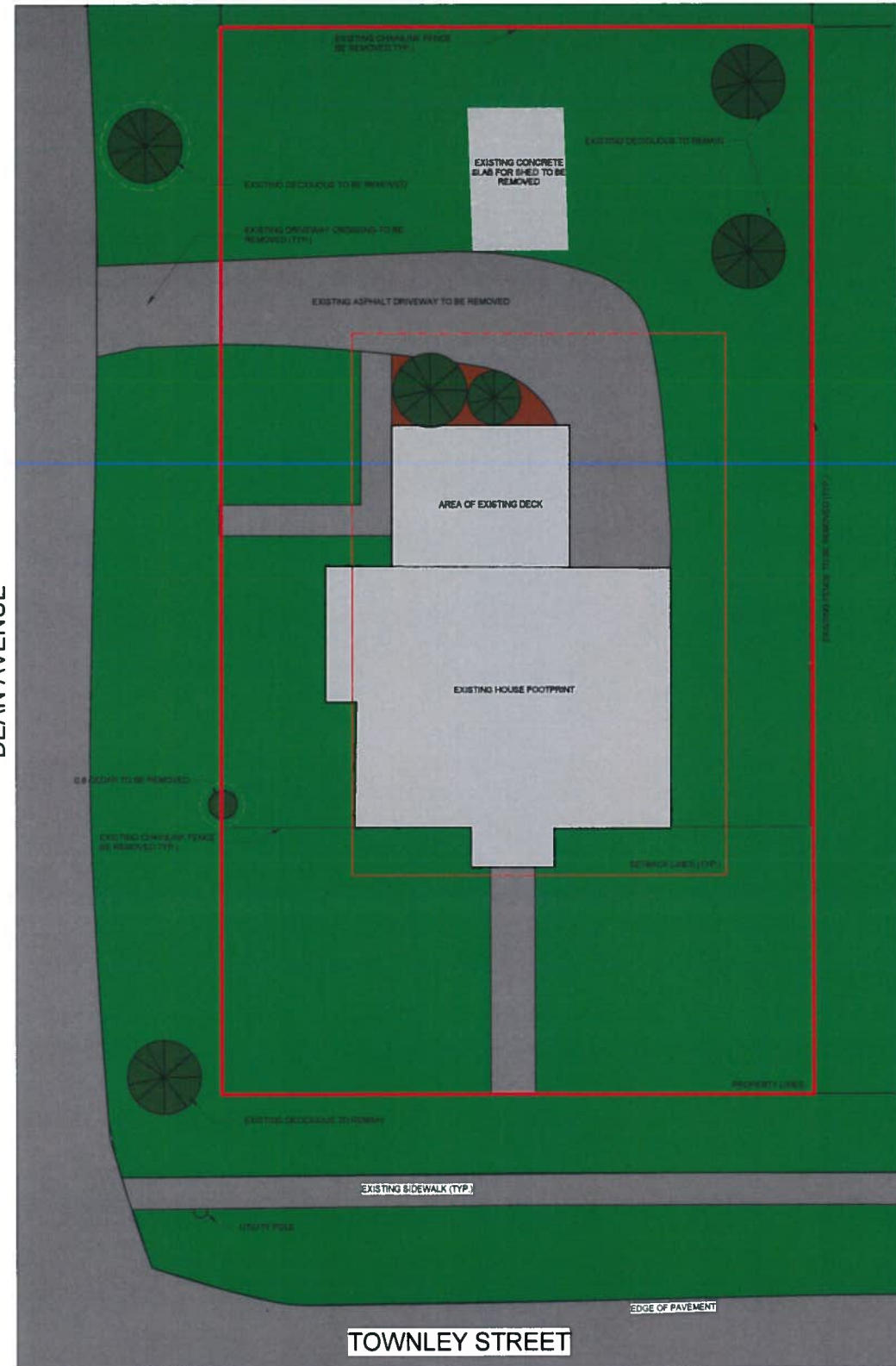
1 Existing Landscape Plan 1 : 100