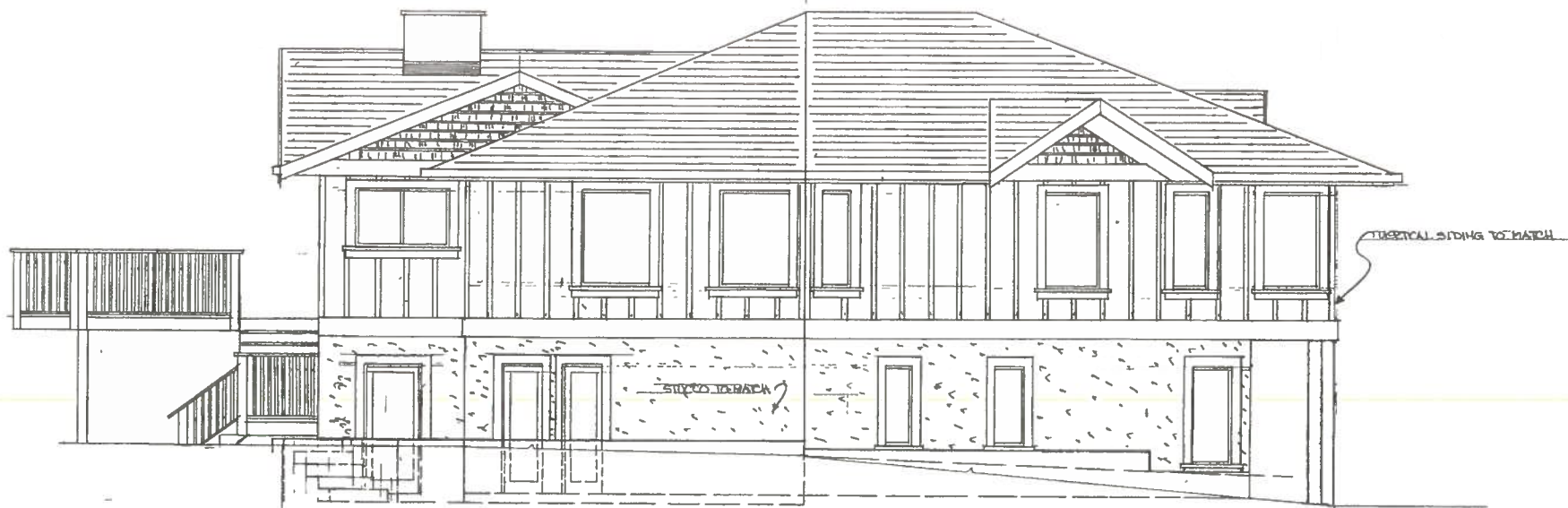
SIDE (SOUTH) ELEVATION 1/4" = 1'-0"