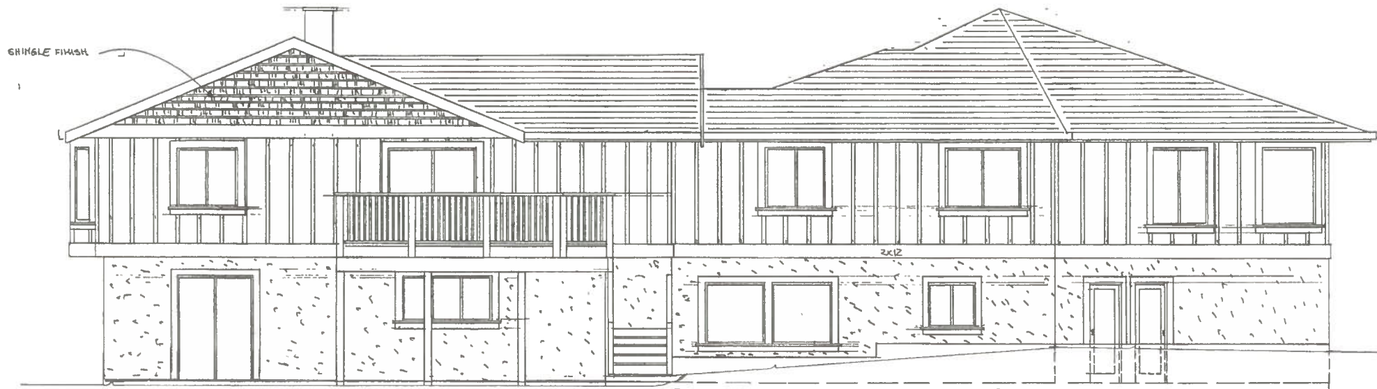
REAR ELEVATION 14/11/17

--- GRASS & ALL GRASS SURFACES EXISTING & PROPOSED ---