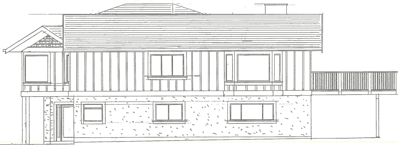
SIDE NORTH ELEVATION 14/11/17